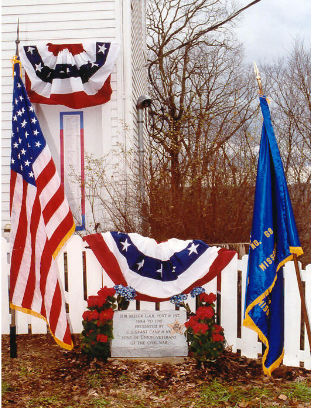
The marker above is at the DN Keeler GAR Post in Wildwood, Missouri; the marker was dedicated in 2001.