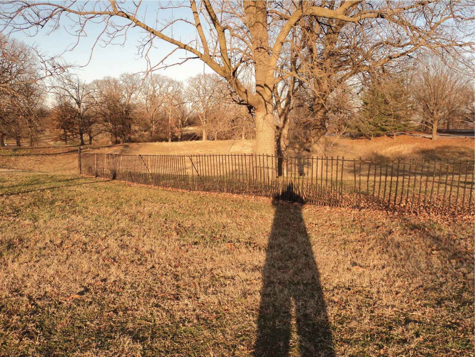
Jefferson Barracks Gate at Scenic Overlook & Grant Dr N38°30.577 W90 °16.521