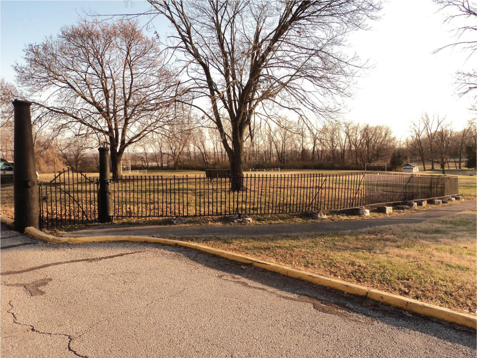
Jefferson Barracks Gate at Scenic Overlook & Grant Dr N38°30.577 W90 °16.521