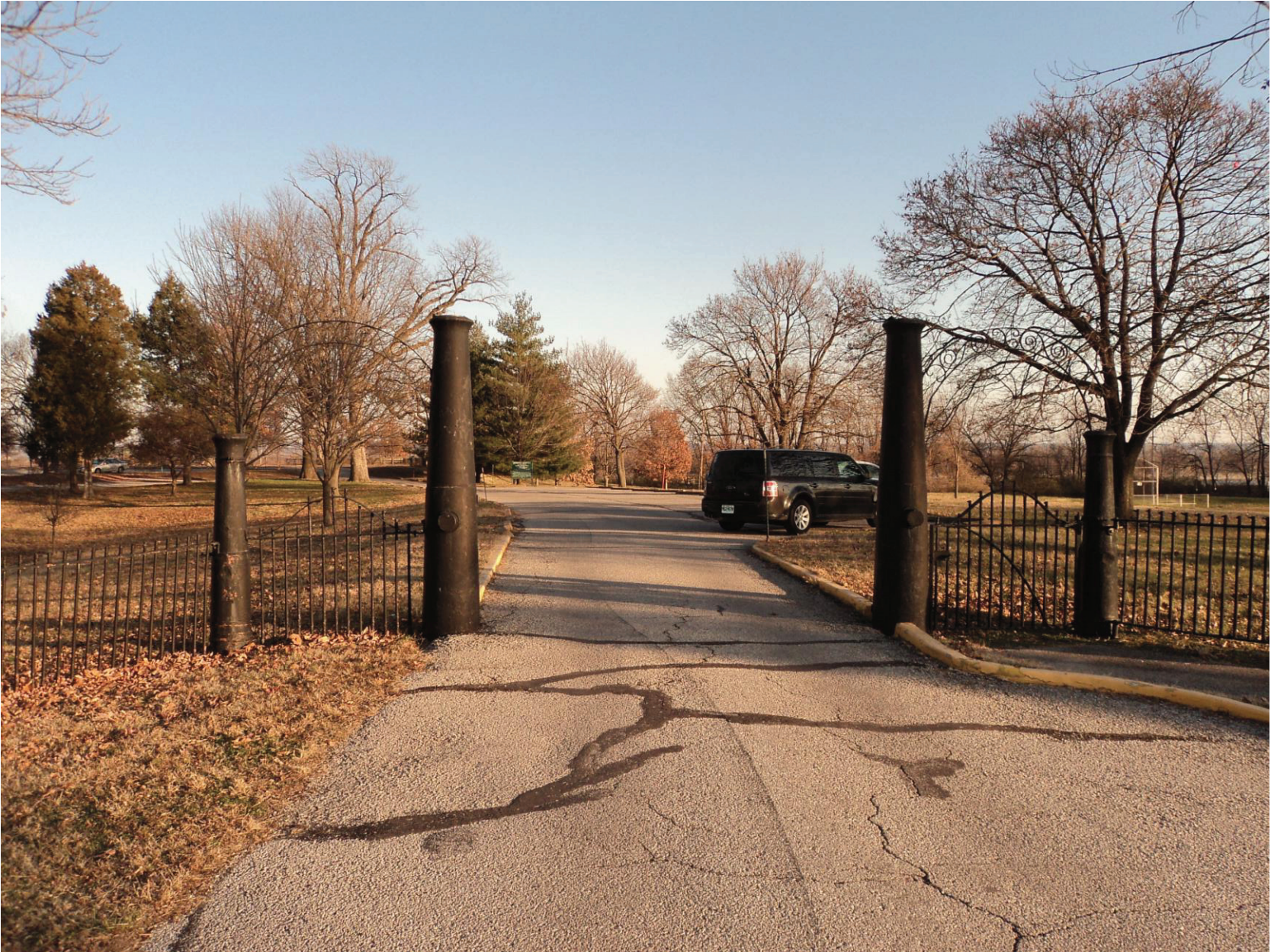
Jefferson Barracks Gate at Scenic Overlook & Grant Dr N38°30.577 W90 °16.521