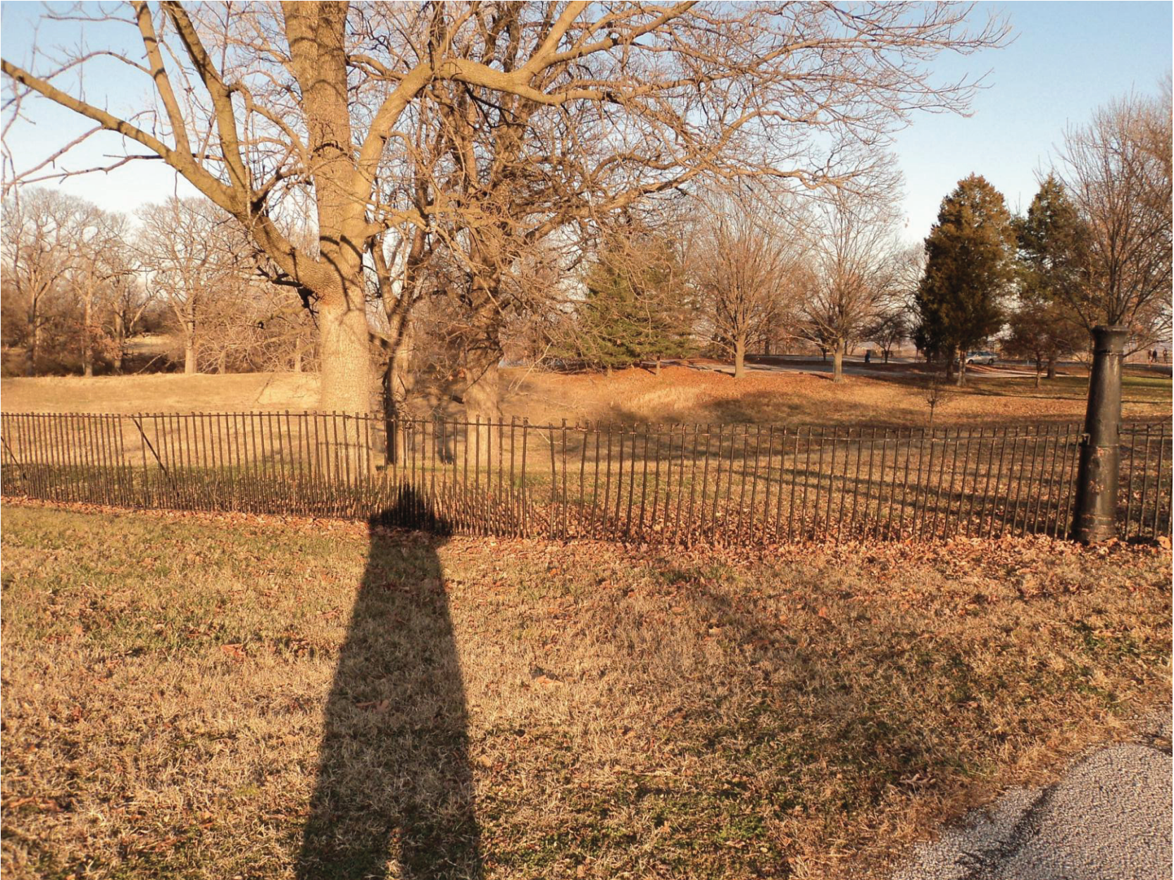
Jefferson Barracks Gate at Scenic Overlook & Grant Dr N38°30.577 W90 °16.521