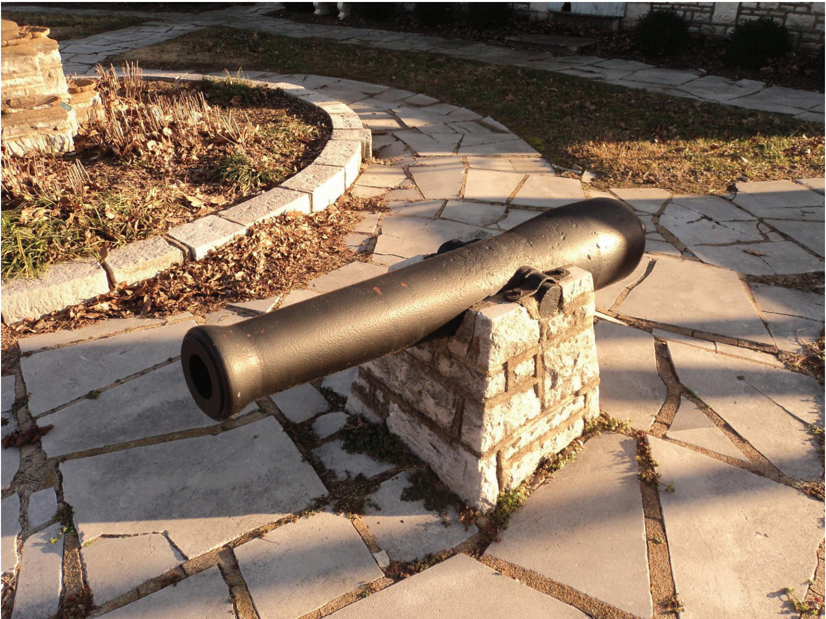
Jefferson Barracks Park Entrance Grant & Gregg 2 Six Pounders Faces N N38°31.233 W90°16.609 Right Cannon