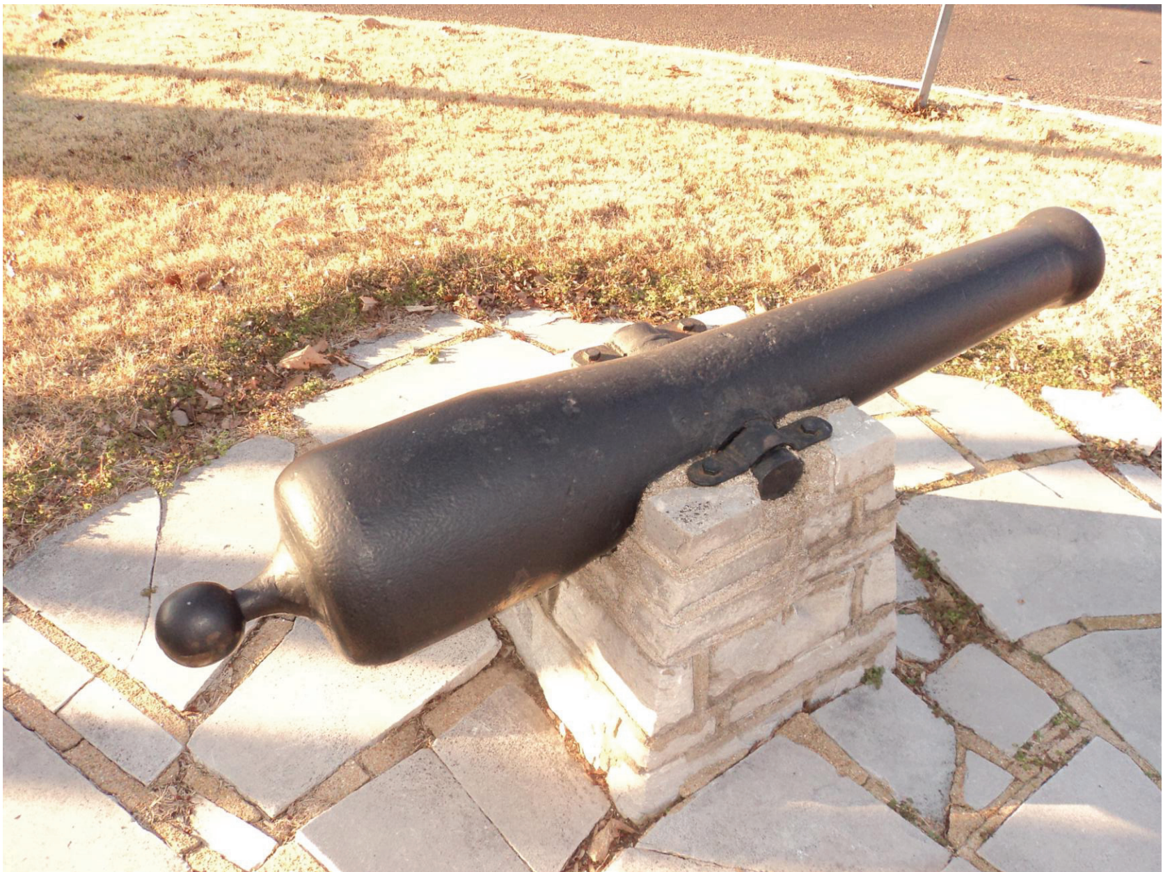
Jefferson Barracks Park Entrance Grant & Gregg 2 Six Pounders Faces N N38°31.233 W90°16.609 Right Cannon