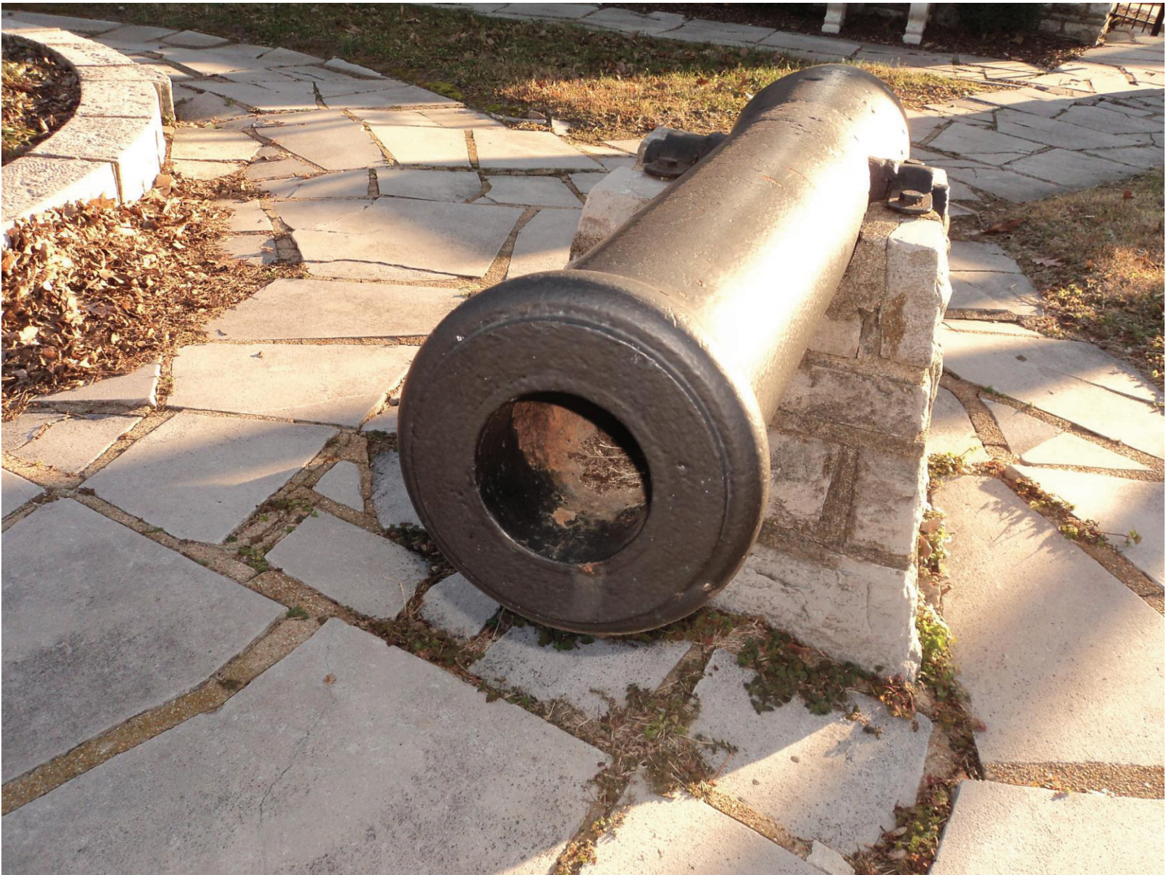
Jefferson Barracks Park Entrance Grant & Gregg 2 Six Pounders Faces N N38°31.233 W90°16.609 Right Cannon