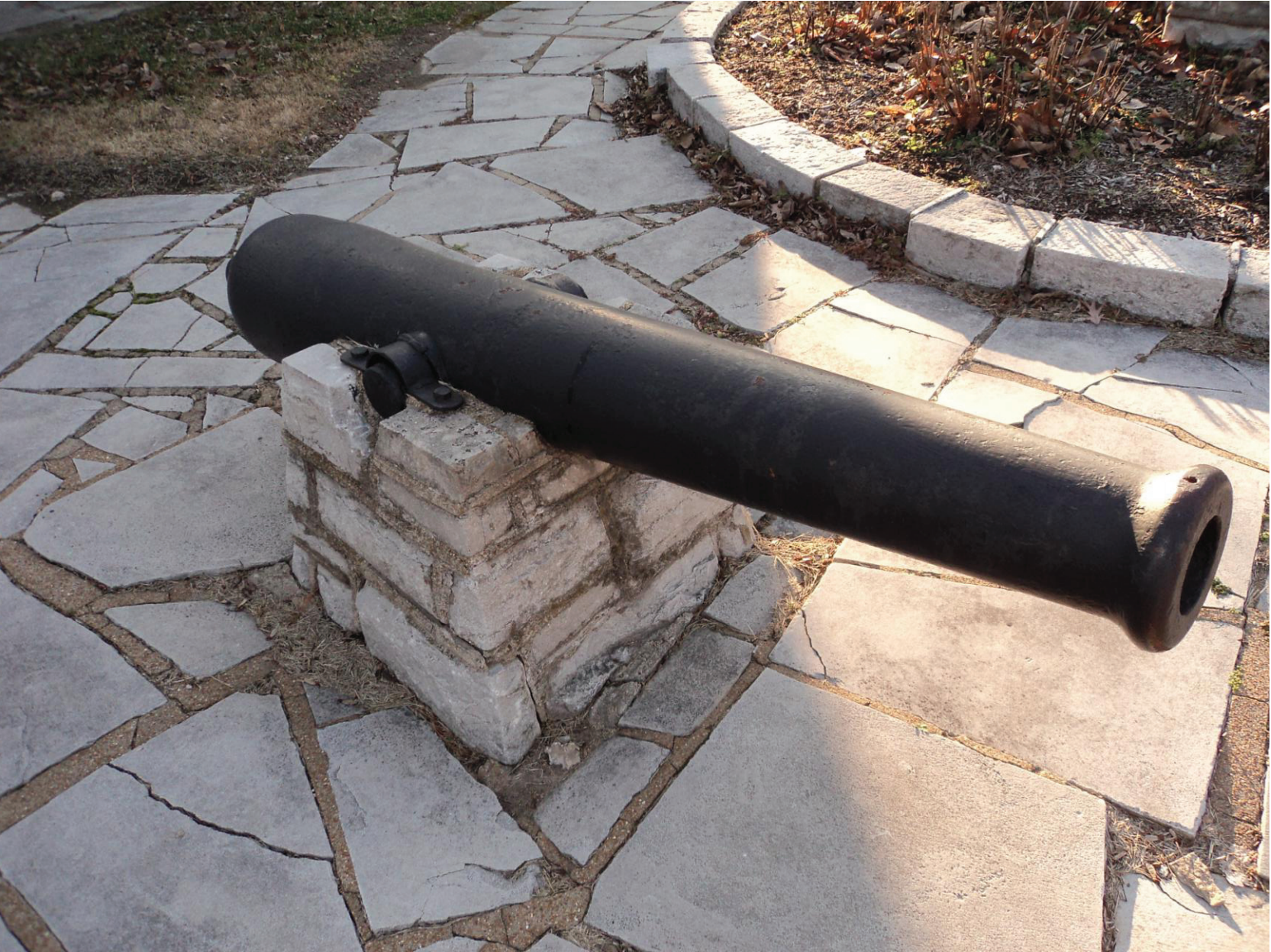
Jefferson Barracks Park Entrance Grant & Gregg 2 Six Pounders Faces N N38°31.233 W90°16.609 Left Cannon