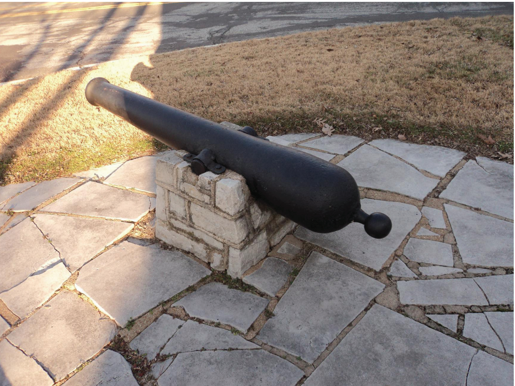
Jefferson Barracks Park Entrance Grant & Gregg 2 Six Pounders Faces N N38°31.233 W90°16.609 Left Cannon