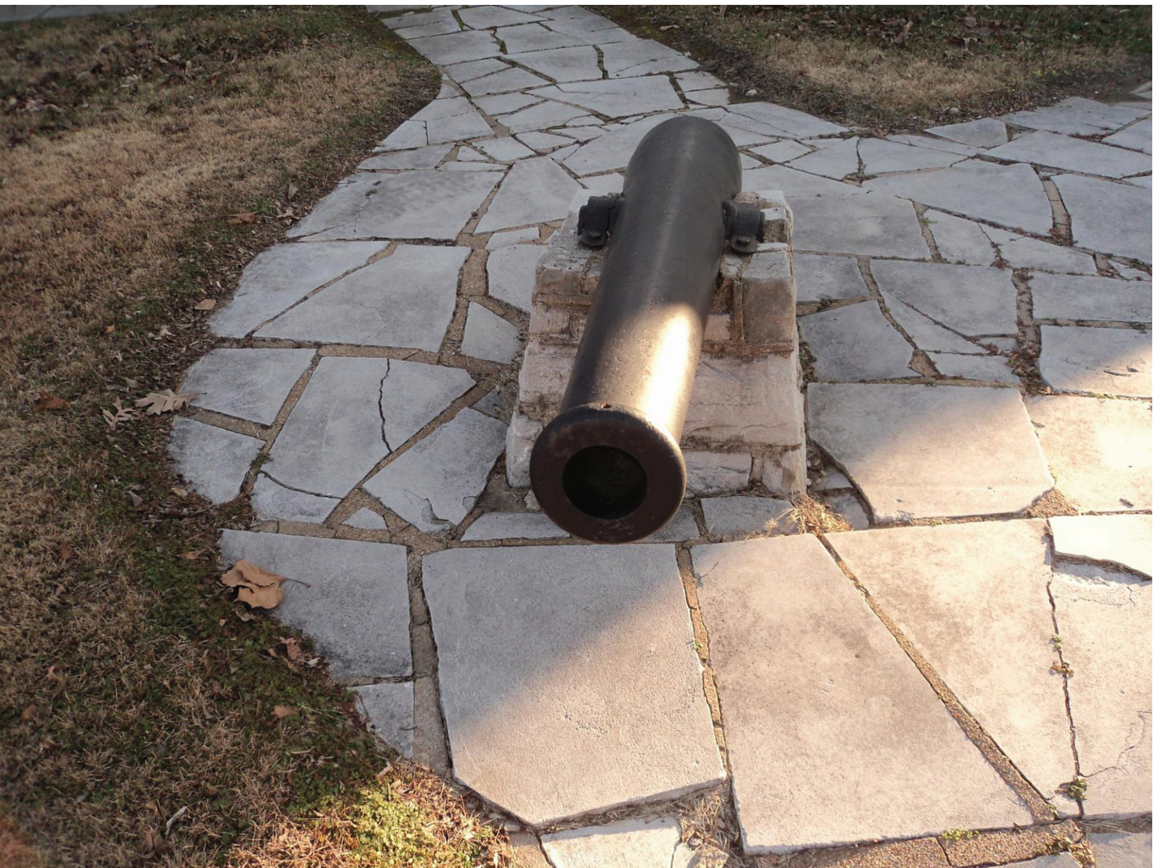
Jefferson Barracks Park Entrance Grant & Gregg 2 Six Pounders Faces N N38°31.233 W90°16.609 Left Cannon