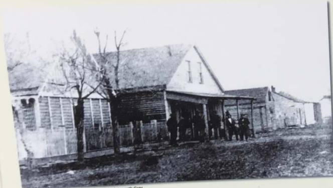
Spring Street (circa 1890-1900).