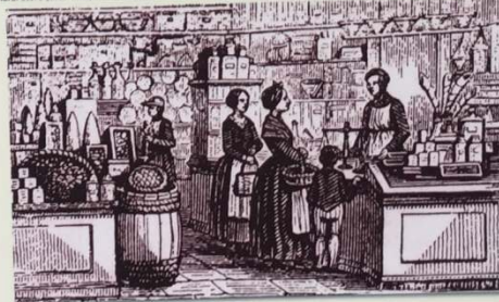
A 19th century woodcut of a general store interior.