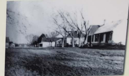
Spring Street, 1908.