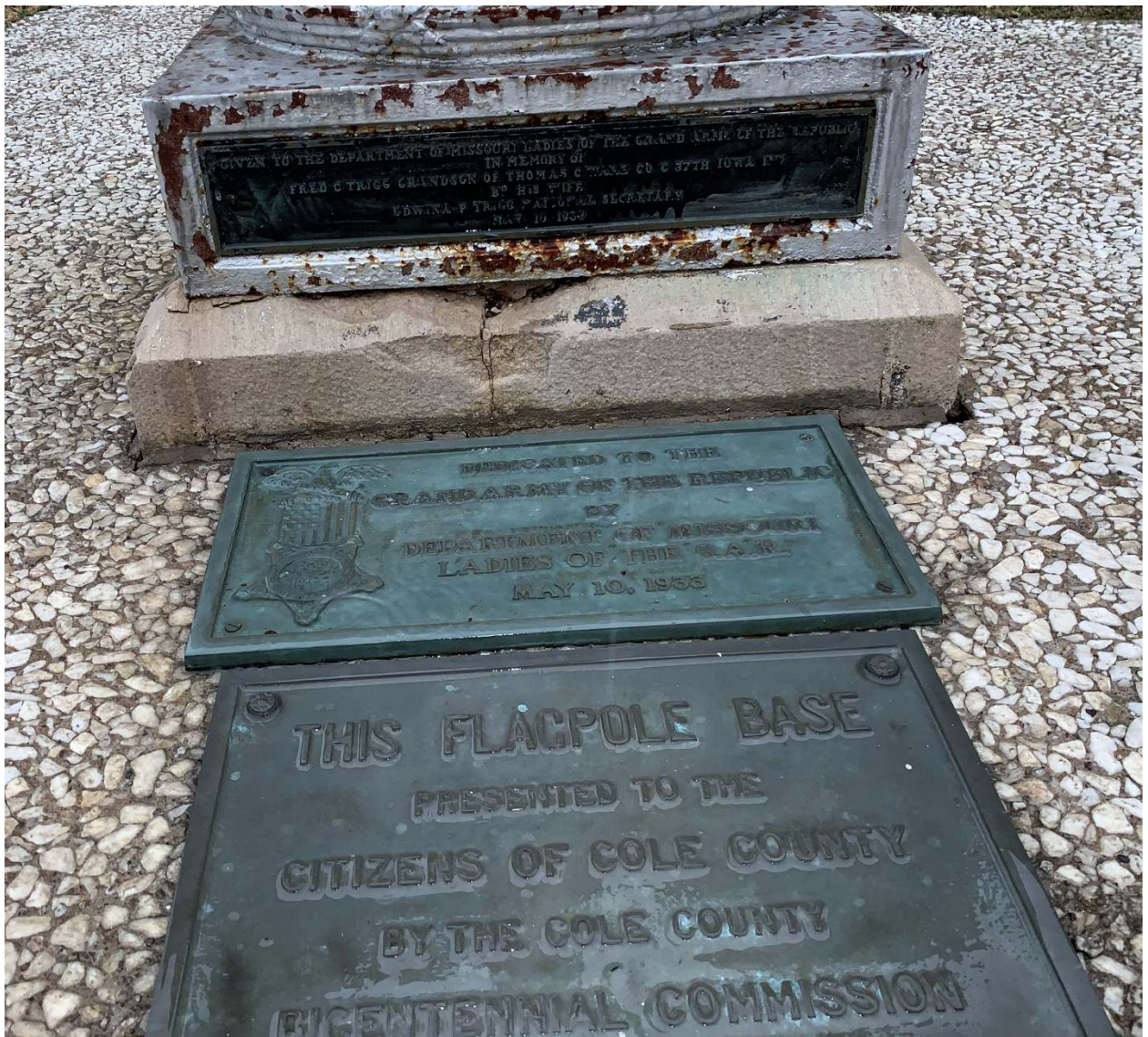
Flagpole at the Cole County Courthouse lawn that was originally was donated by the GAR in 1933