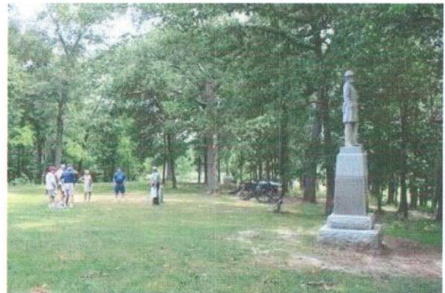
Photographed By Dale K. Benington, July 19, 2012

View of the front of the historic monument with a view of a park ranger sharing historical battle related background information with a group of park visitors.