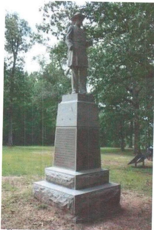
July 18, 2012