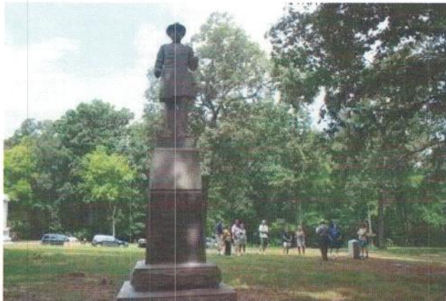
Photographed By Dale K. Benington, July 19, 2012

Close-up view of the bronze art work scene depicting the 11th Michigan in combat at Chickamauga.