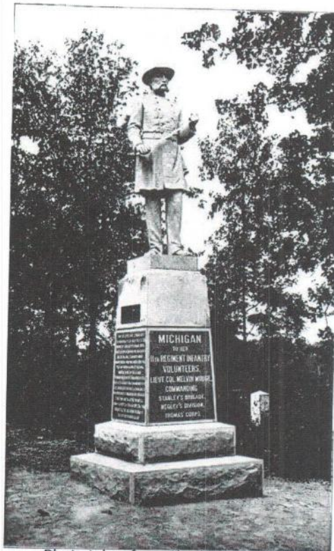
Photo taken from Charles Eugene Belknap's book on Michigan units, published 1899