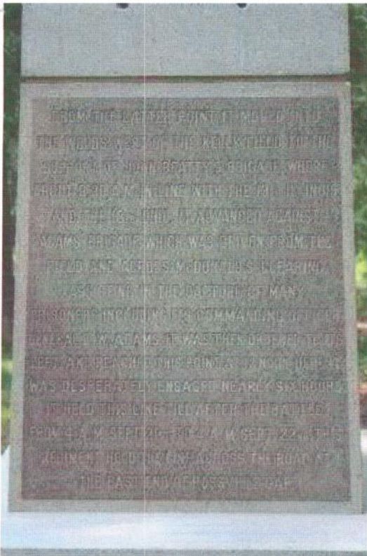
July 19, 2012