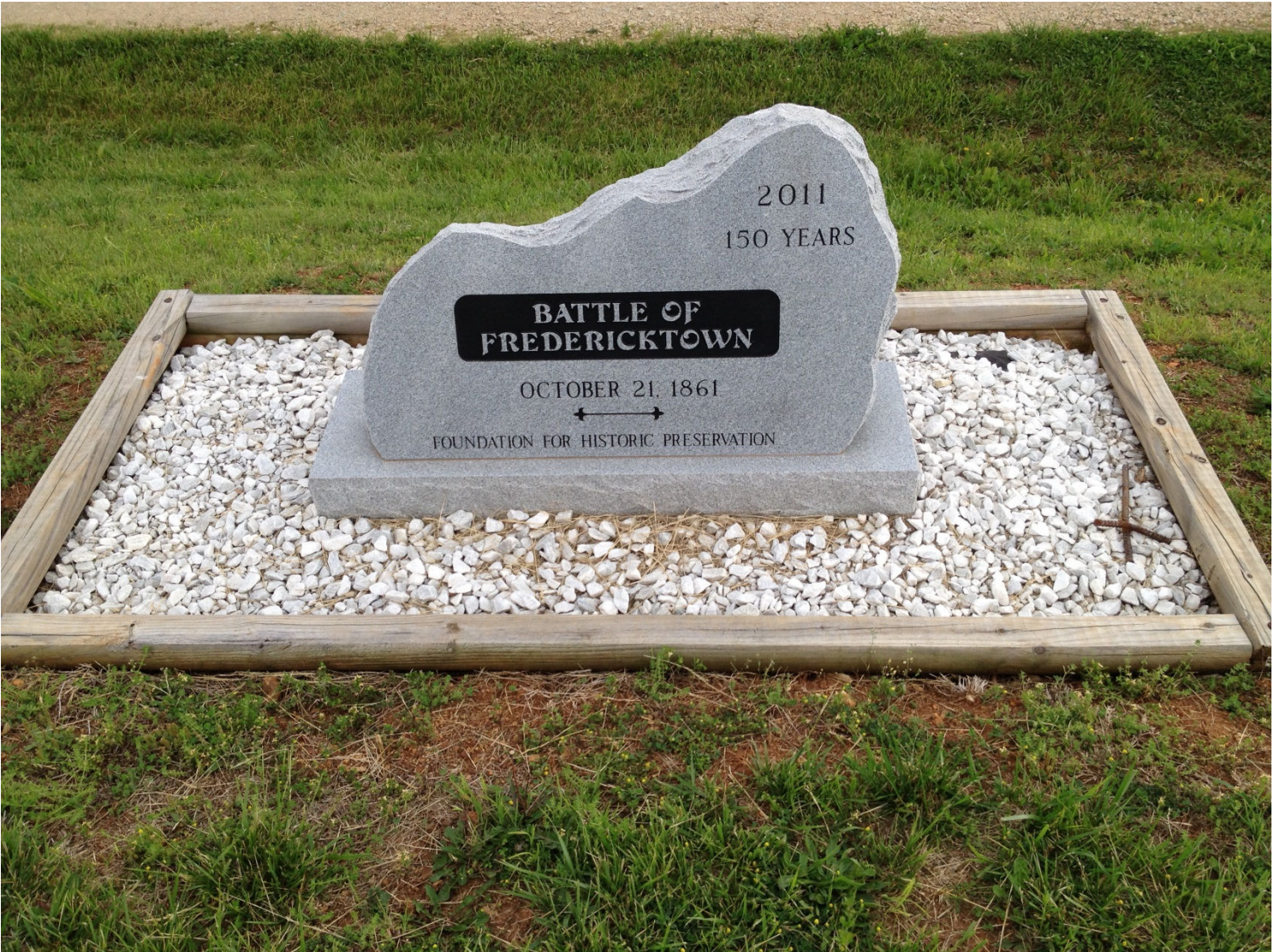
2011 150 Years BATTLE OF FREDERICKTOWN October 21, 1861 Foundation for Historic Preservation