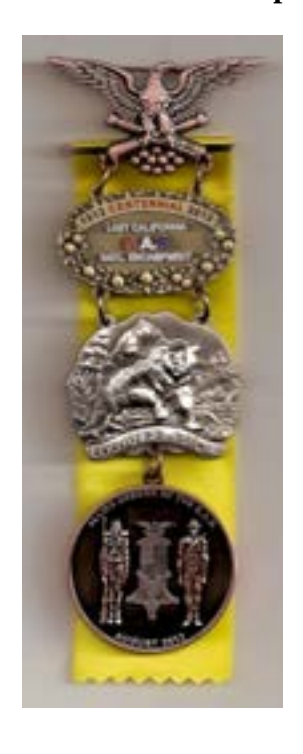
SONS OF UNION VETERANS OF THE CIVIL WAR