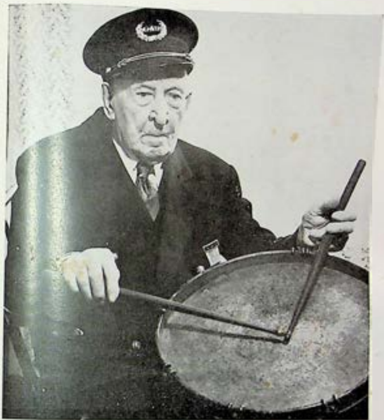
ALBERT WOOLSON Sole survivor of the Union Army of 1861-65 Sr. Vice Commander-in-Chief Grand Army of the Republic Past Commander-in-Chief (conferred 1953) Sons of Union Veterans of the Civil War