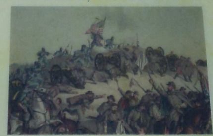
Kurz & Allison, Battle of Nashville

the remaining black Union soldiers, 29 died of disease, especially cholera, and four died of unreported causes — an astounding 35 percent total death rate. Fighting for emancipation, all gave the last full measure of denotion.