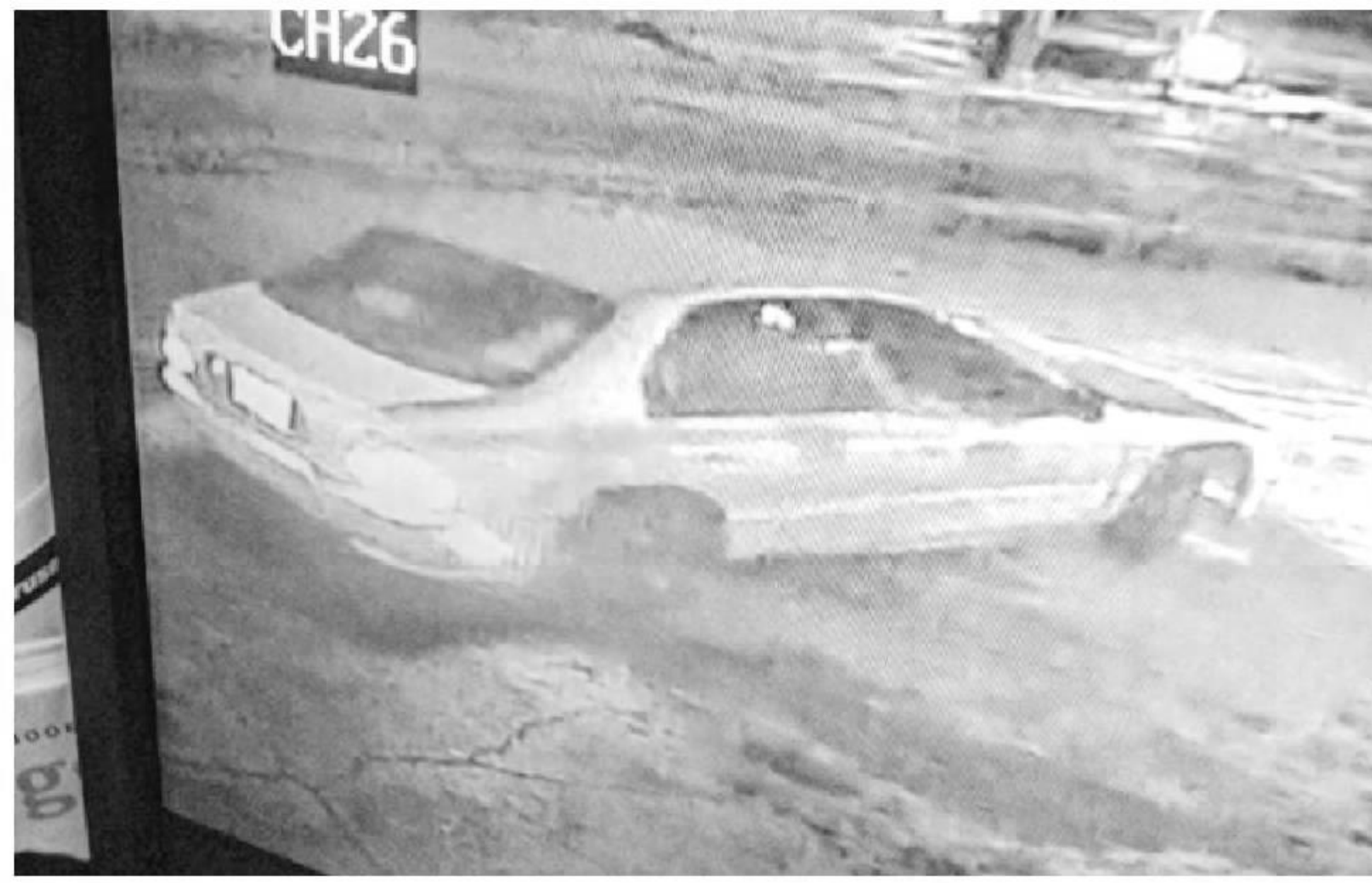
Richmond police are looking for two suspects who have robbed a vending machine at Best Pawn, 1700 N.W. Fifth St.

More crime information can be found at www.pal-item.com . Click on the News tab at the top of the page, and then Cops and Courts on the top left.