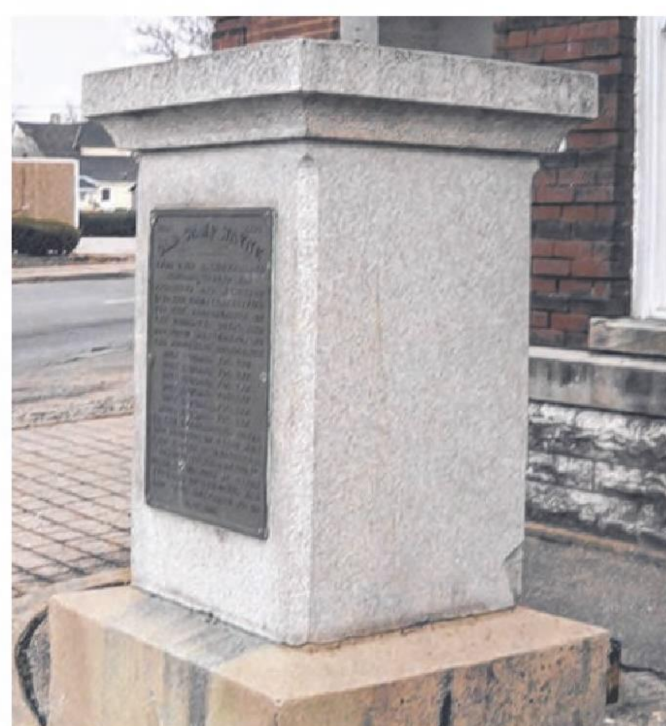
This monument in front of the former firehouse at South Ninth and E streets marks the site as the location of the Civil War-era Camp Wayne.