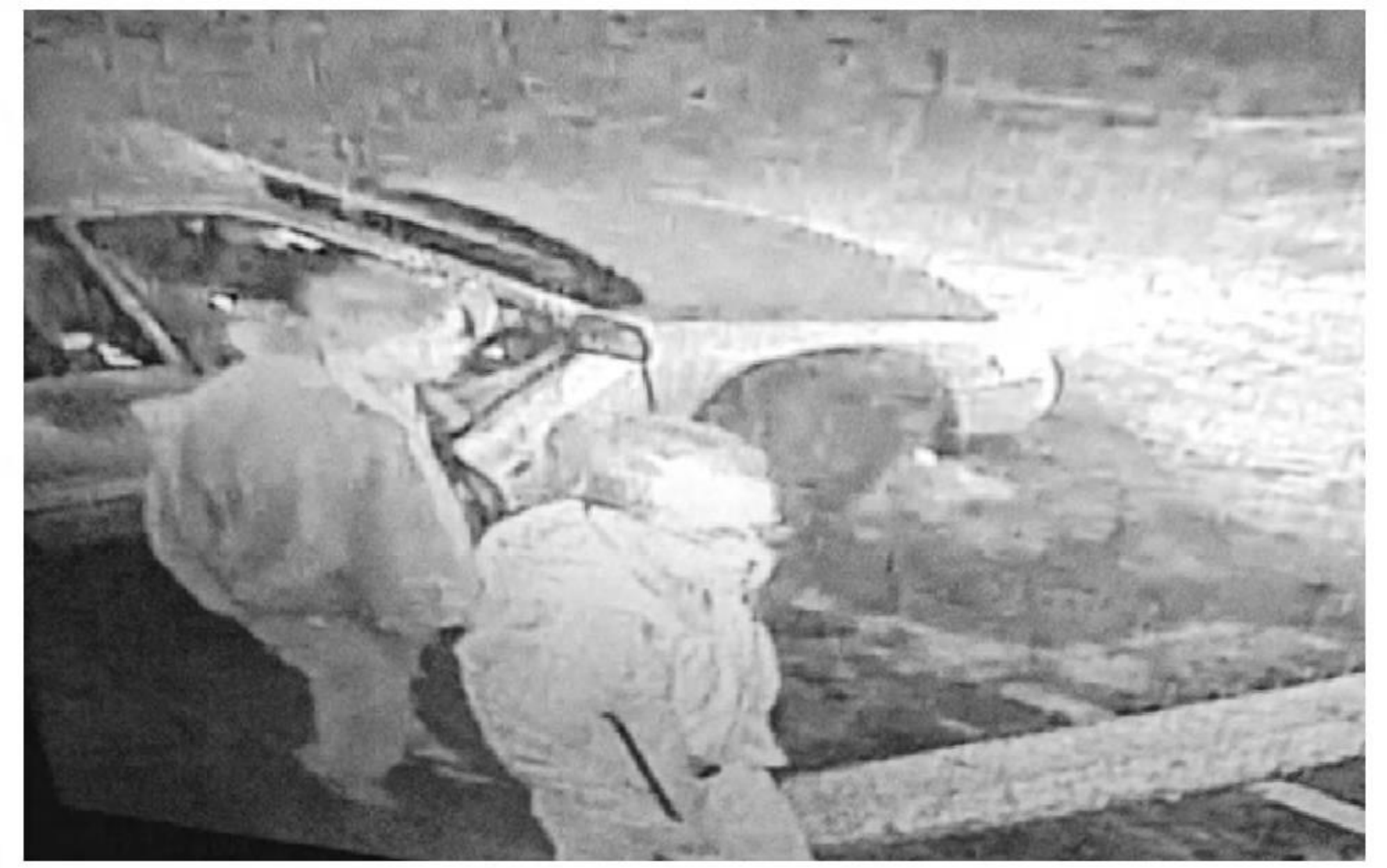
Police say the two male suspects have pried open the machine and taken coins.