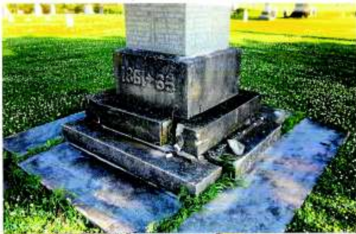
looking from south east