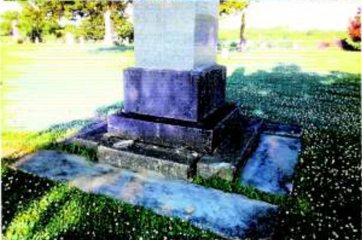
looking from north east