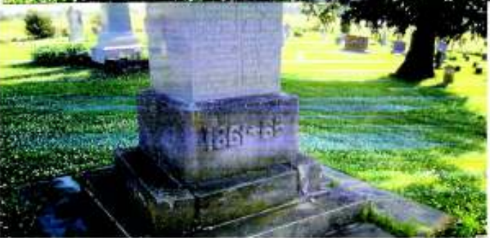
looking from south west