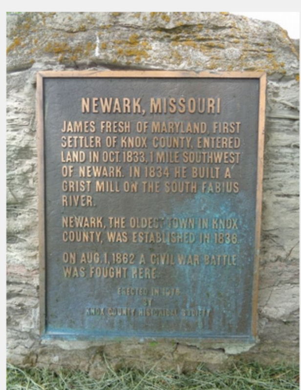
Photographed By Jason Voigt, May 10, 2020

SONS OF UNION VETERANS OF THE CIVIL WAR National Civil War Memorials Committee