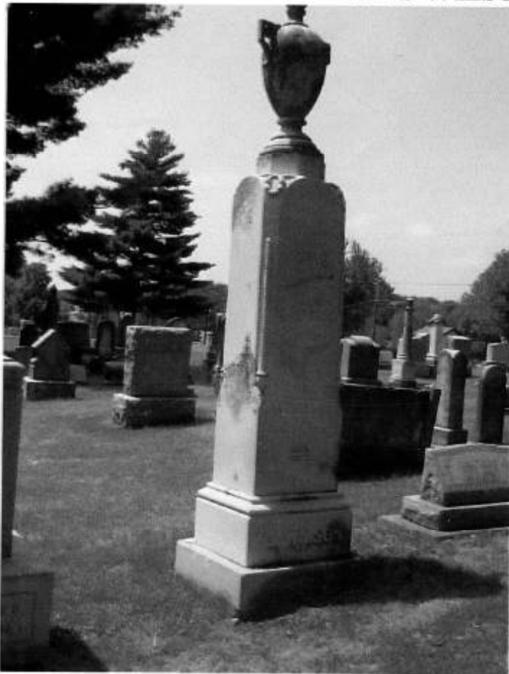
At the Troy City Cemetery, Lincoln Co., MO.