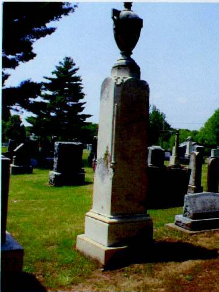
At the Troy City Cemetery. Lincoln Co., MO.