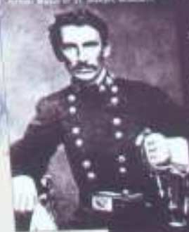
Confederate General M. Jeff Thompson, former Mayor of St. Joseph, Missouri.

In April 1861, St. Joseph, as the "Gateway to the West" was the central point of the nation's transportation and communications networks. As part of the modern technology to wage war, St. Joseph became singularly important to the North as the western terminus of the nation's railroad system. This vital rail link led to the important goldfields of Colorado and California. It was also the eastern terminus of the Pony Express overland mail route to California.