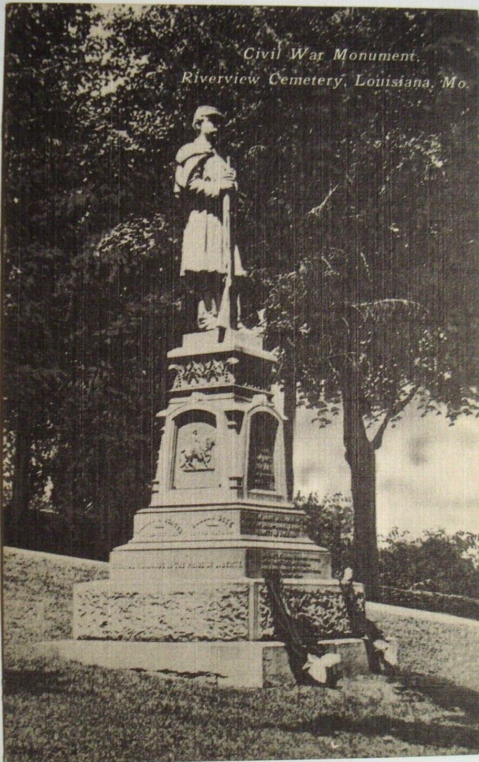
Postcard Tichnor Quality Views by Tichnor Bros, Inc, Boston, MA circa 1915-1950 [before showing zipcodes on the back of postcards]