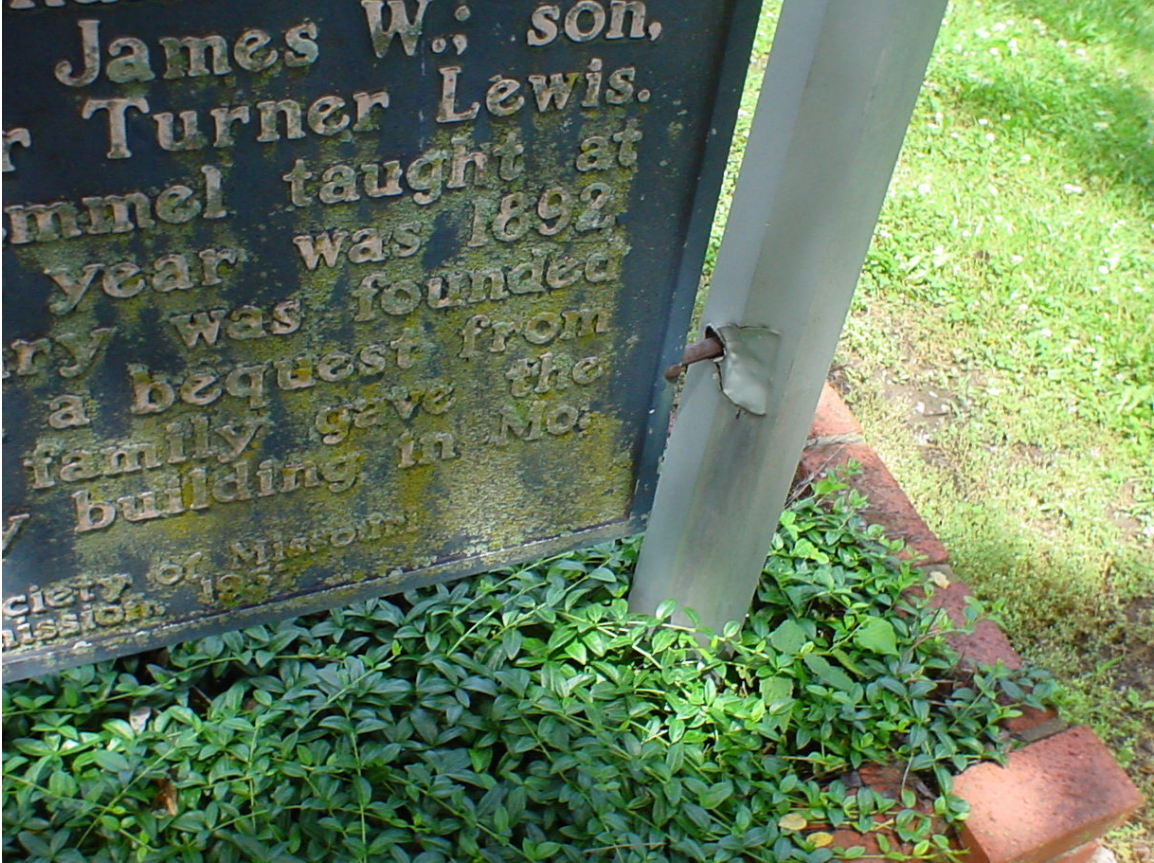
MINOR REPAIRS NEEDED