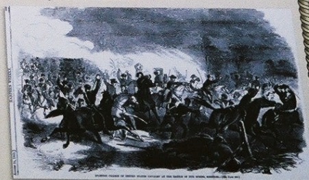
The heavy fighting in Missouri early in the war was depicted in several Harper's Weekly drawings, including this one from Aug. 24, 1861.

Estimates for casualties sustained at Dug Springs are at most 20 Southerners killed and 50 wounded and four Union men killed with 37 wounded. The Confederates called the incident "Rains' Scare" and the action caused McCulloch's already negative opinion of the fighting capabilities of Missourians and their leaders to sink even lower. Nevertheless, the Southerners proceeded with their plan to advance on Springfield along the Wire Road. Had Lyon pursued them after routing Rains' advance he might have stalled the Southern force, but the numbers were against him. As it was, he made the fateful decision to strike one last time before retreating to Rolla; this time it would be on Aug. 10 in the bloody battle at Wilson's Creek, where the outnumbered Union army was forced to retreat. Lyon, falling in the thick of the fight, became the first Union general to be killed in action.