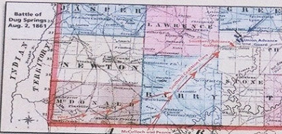
The Missouri State Guard and Confederate troops under Gen. McCulloch planned to march up the Wire Road to attack Gen. Lyon at Springfield, as shown on this map, adapted from an 1861 Lloyd's Official Map of Missouri.

According to Lyon's intelligence, the Southern army was advancing on Springfield in three columns, with the main column moving from Cassville along the Wire Road. He waited until