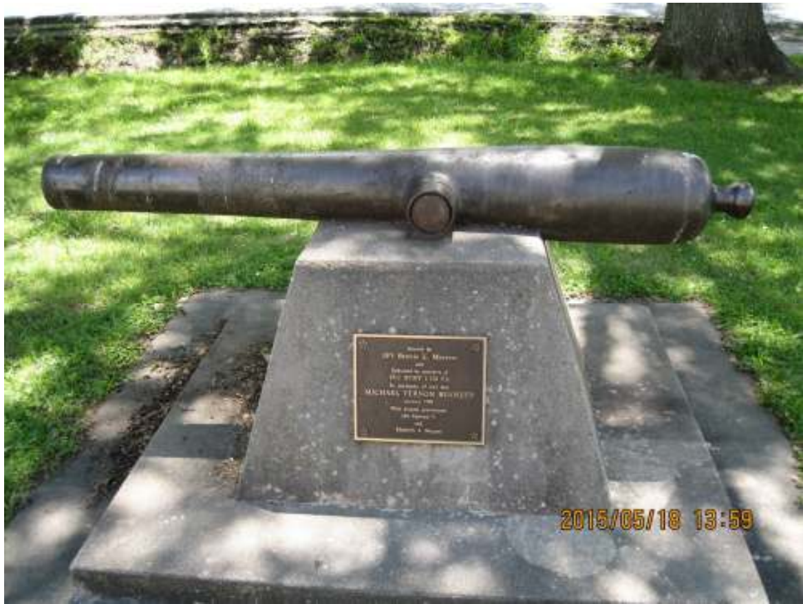
Missouri National Guard Armory, Mexico, MO , 917 W Curtis St., Mexico, MO