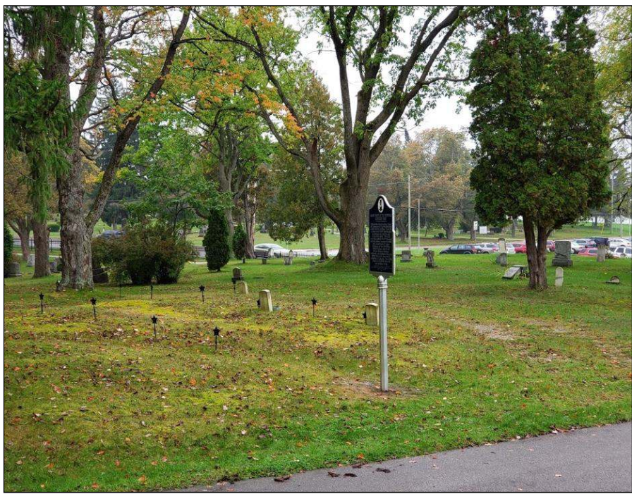
Backside of Historical Sign (Looking to the Southwest)