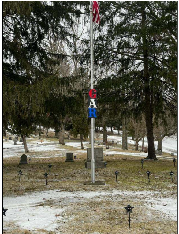
GAR Flag Pole with GAR Letters Installed (Looking to the East) Historical Sign is to the Left/North (out of picture)