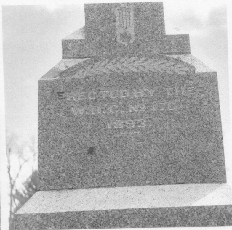
Vicksburg, Mi ACKER POST #220 WRC #176