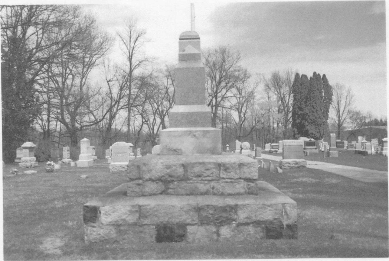
ACKER POST 220