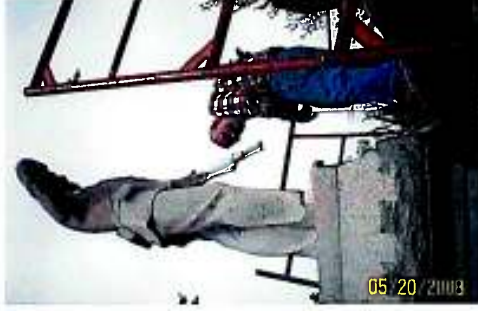
Prairie River Cemetery – Statue Restoration (Broken Rifle) Centreville, MI