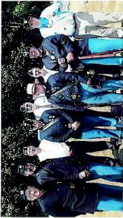
Photograph 10 - A group picture of the Sons of Union Veterans of the Civil War, Camp #135