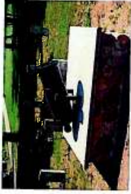
Oaklawn Cemetery – Cannon Restoration Sturgis, MI