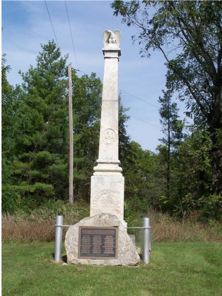
Memorial Boulder with Plaque next to Civil War Monument