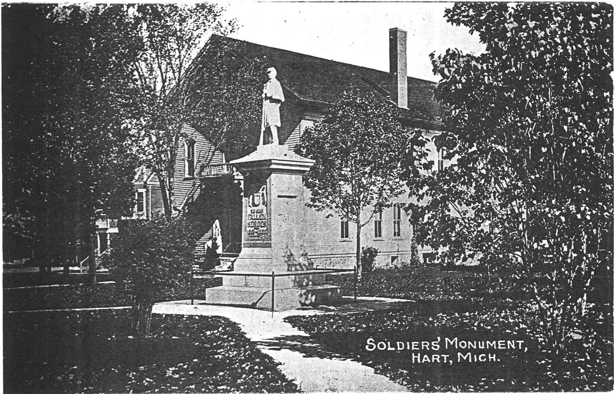
SOLDIERS' MONUMENT, HART, MICH.