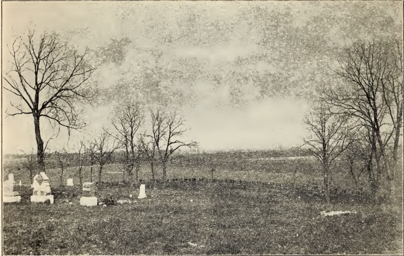
VIEW LOOKING EASTWARD.