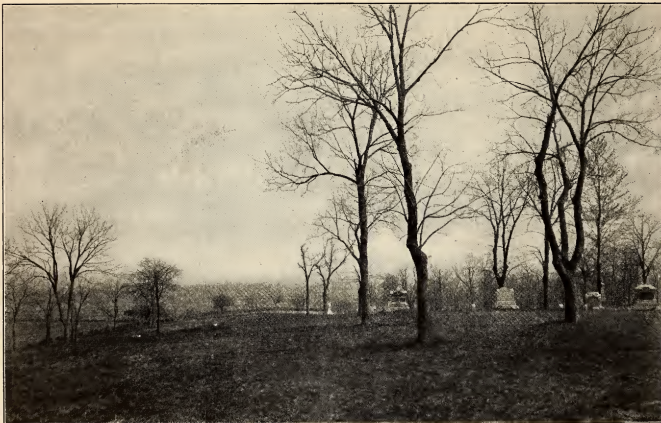
VIEW LOOKING SOUTHWARD.