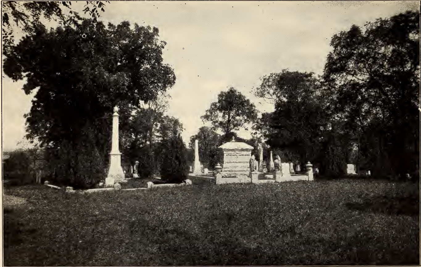
MONUMENTS OF OTIS LITTLE AND ROBERT LITTLE.