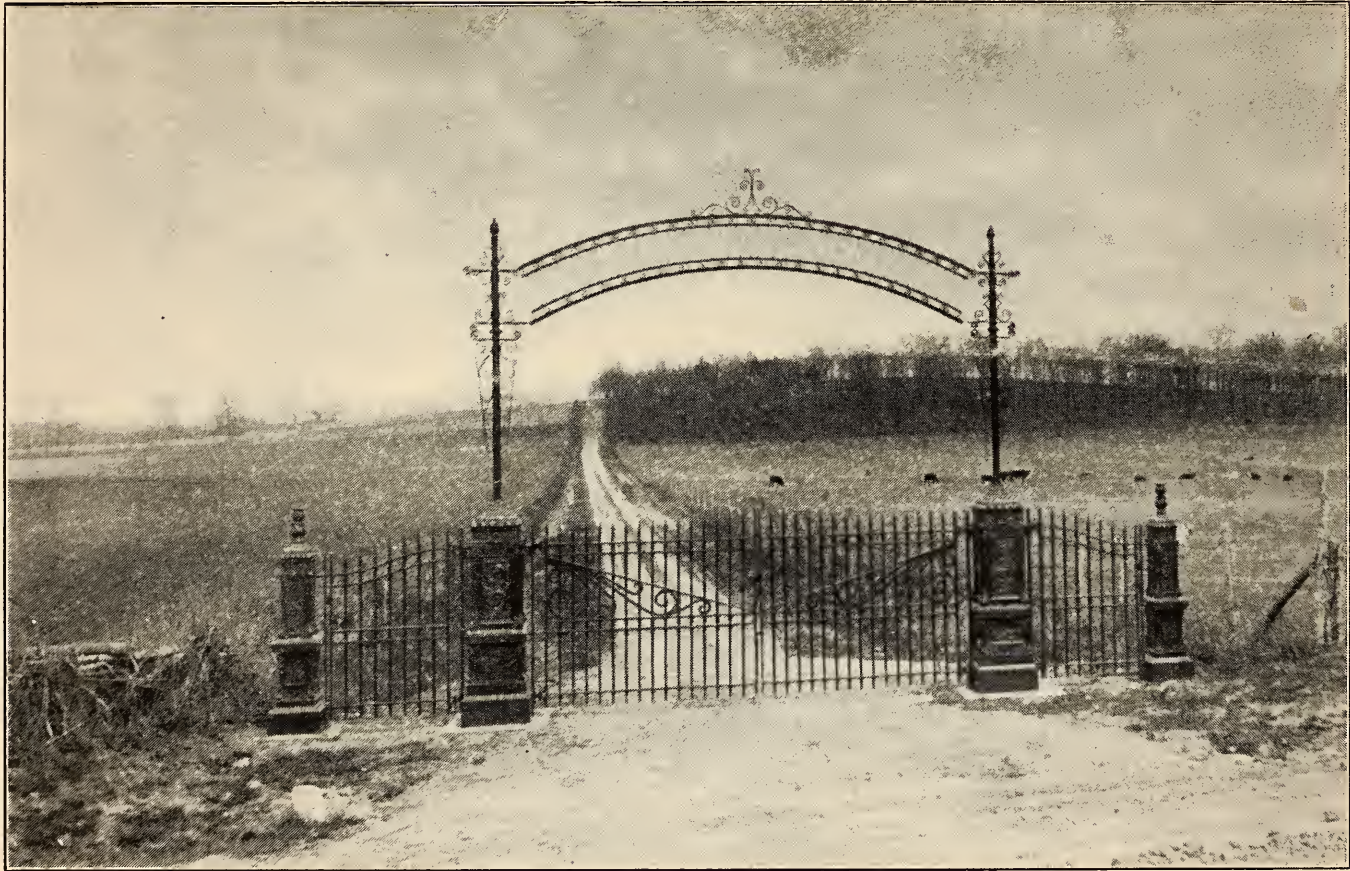
VIEW OF CEMETERY ENTRANCE.