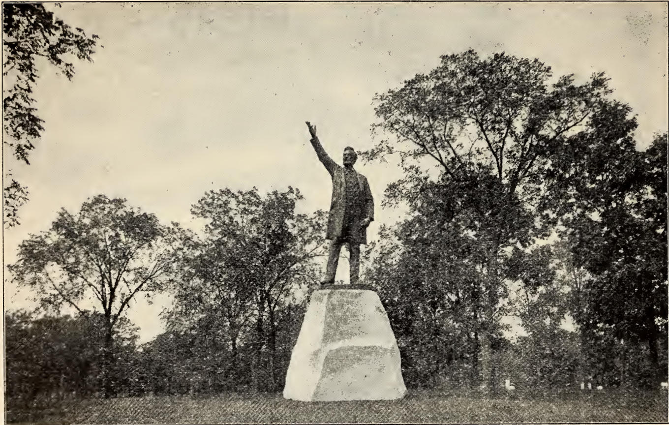
VIEW LOOKING WESTWARD.