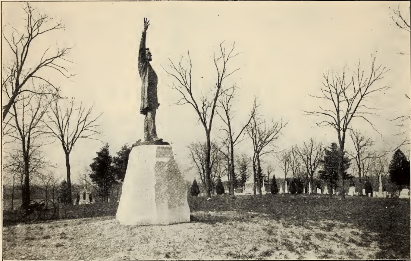
VIEW LOOKING NORTHWARD.