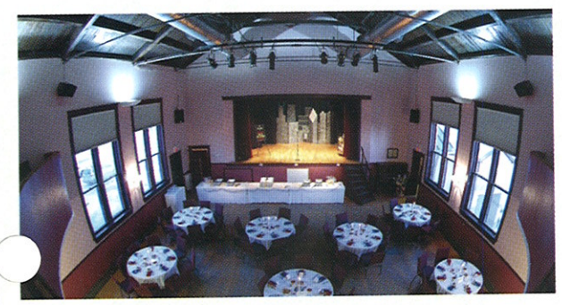
Memorial Hall provides full sound and lighting systems

Memorial Hall is listed in the National Register of Historic Places. Since it was built, it has served as not only a political and governmental hub, but also as a civic, educational, recreational and cultural center of the Village of Richmond.