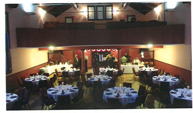
Authentic balcony and ticket booths lend to the original charm of Memorial Hall