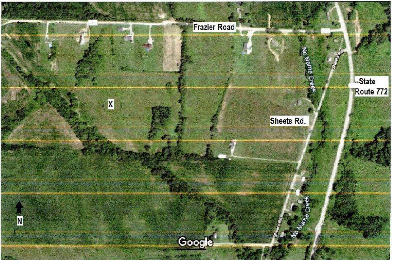
X- approximate location of headstones and plaque

200 ft