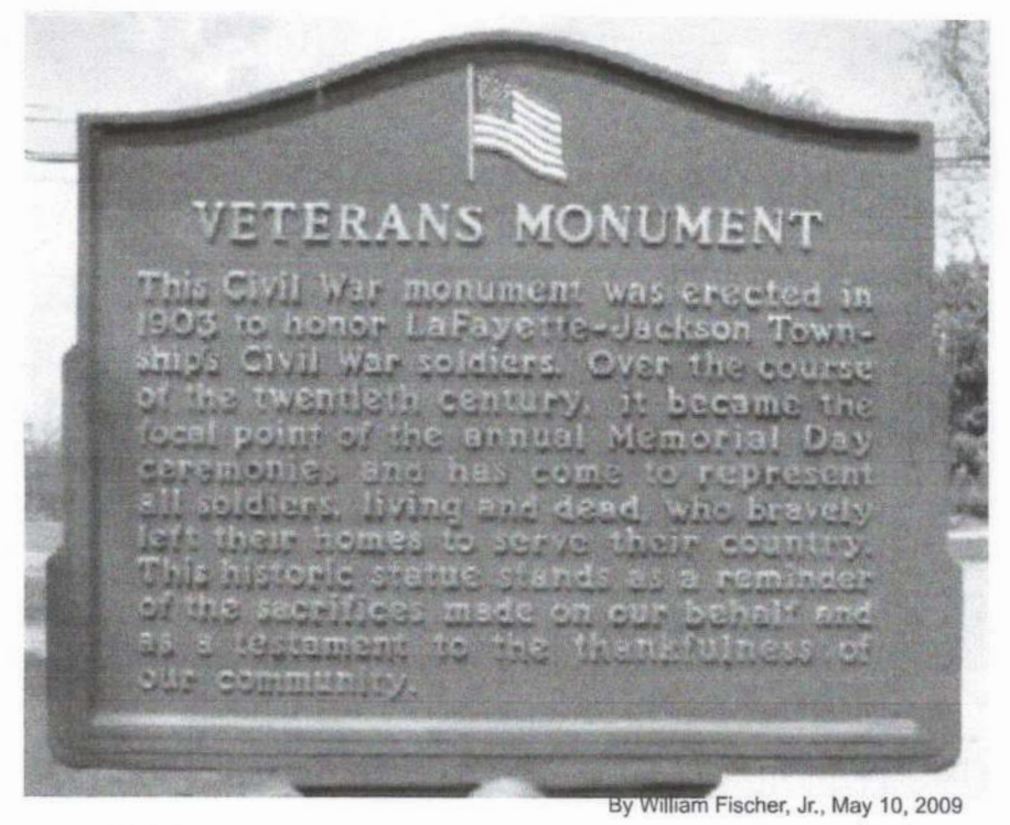
3. LaFayette-Jackson Twp Veterans Monument Marker (Side A)