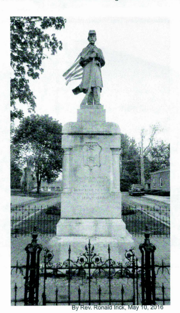
6. LaFayette - Jackson Township Civil War Memorial Marker