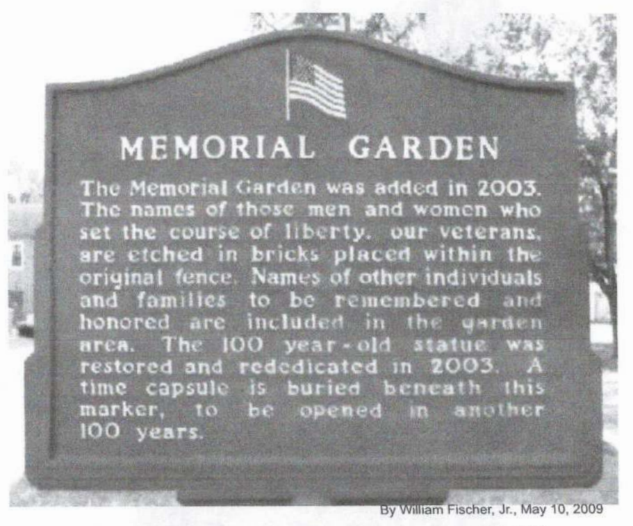
4. LaFayette-Jackson Twp Memorial Garden Marker (Side B)