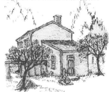
"The Little Brown House on the Hill"