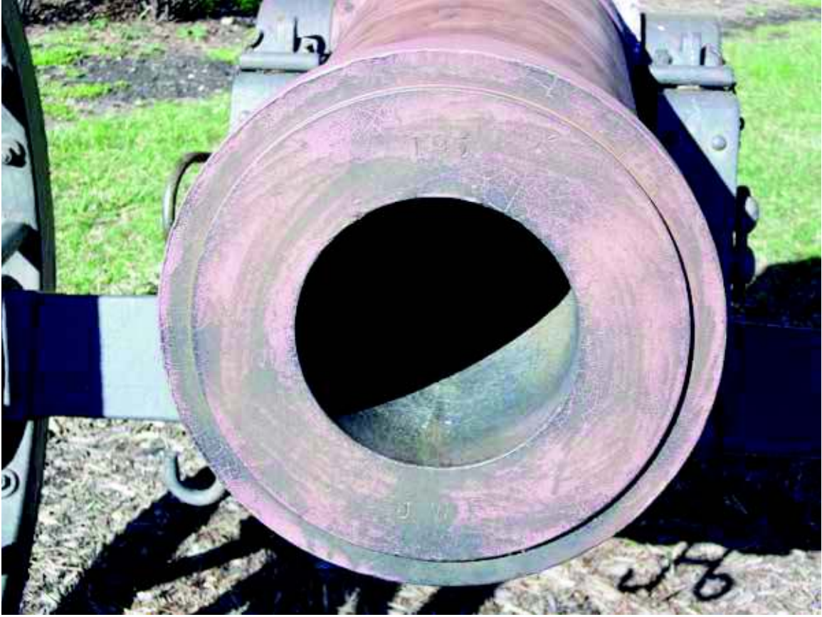
24-Pound Flank Howitzer M1844 Muzzle