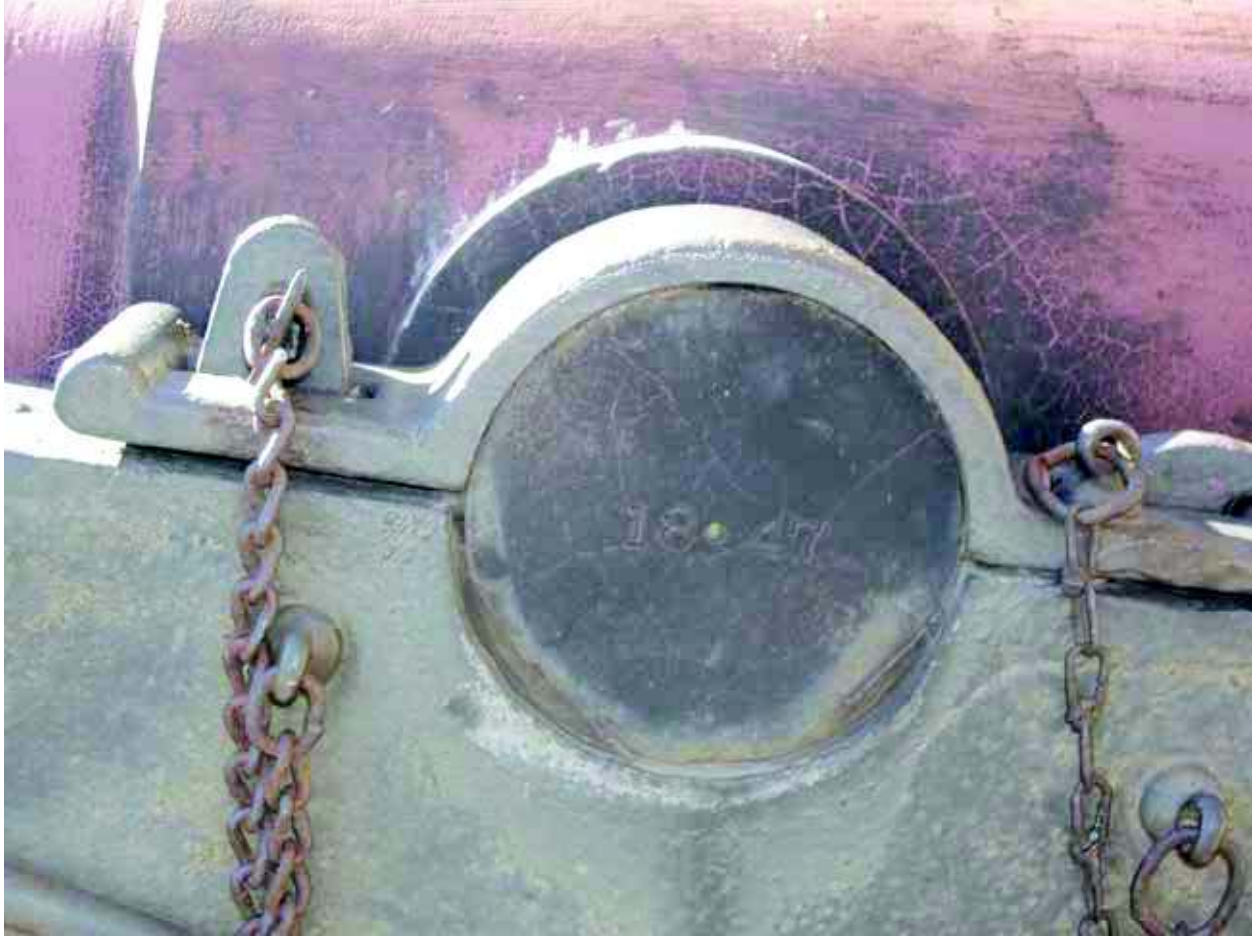
24-Pound Field Howitzer M1841 Right Trunnion