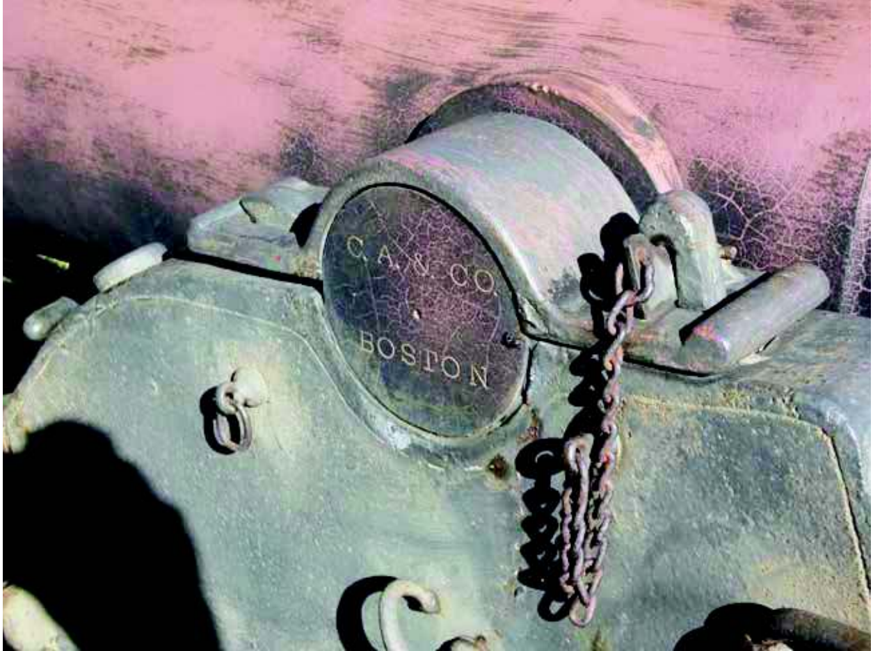
24-Pound Flank Howitzer M1844 Left Trunnion