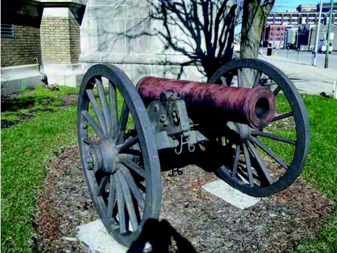
24-Pound Flank Howitzer M1844