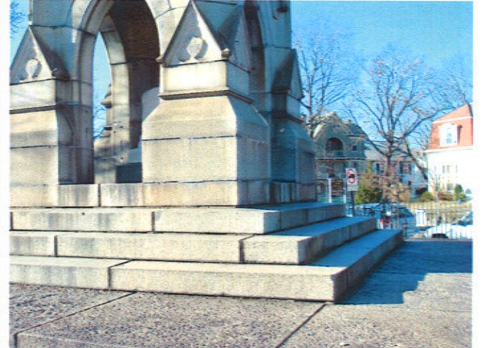
FRONT LEFT BASE