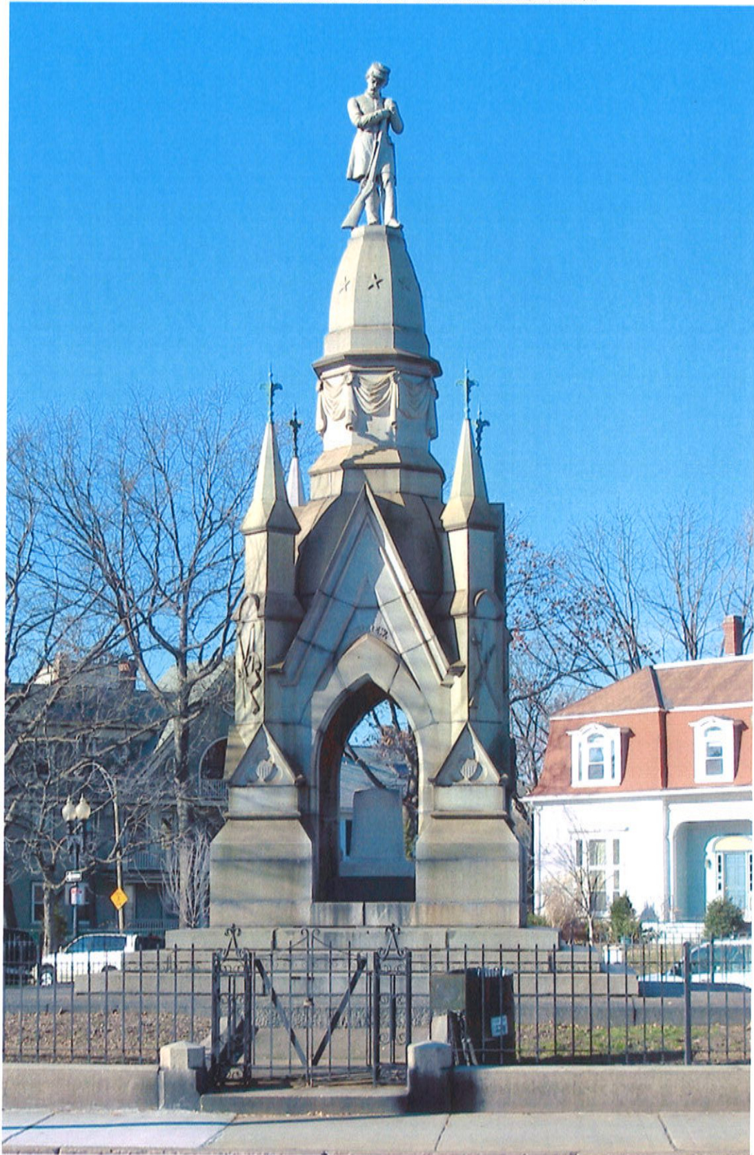
WEST ROXBURY CIVIL WAR MONUMENT