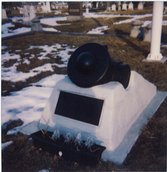
Bellevue Cemetery LAWRENCE MASS