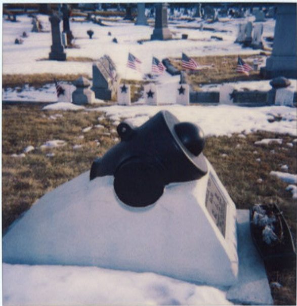
Belleve Cemetery LAWRENCE MASS