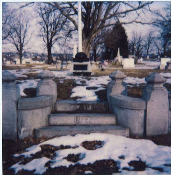
Bellevue Cemetery Lawrence Mass