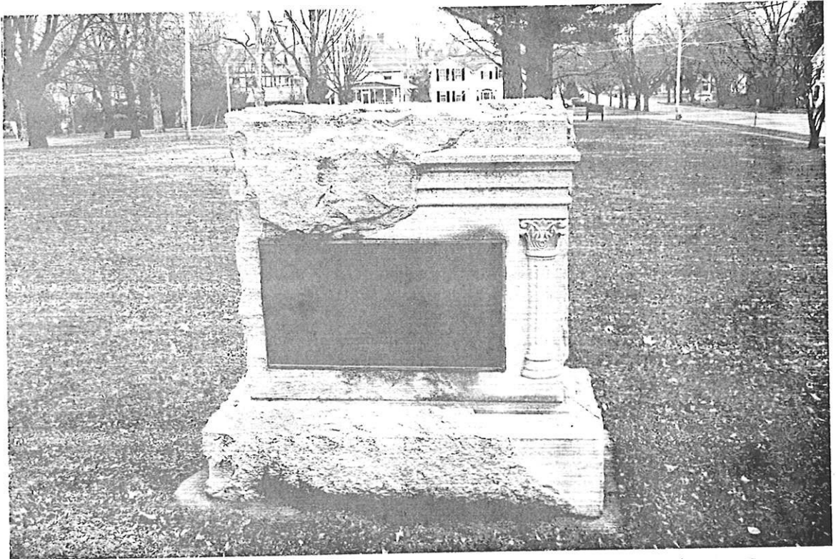
Cenotaph honoring General Stephen Hurlbut