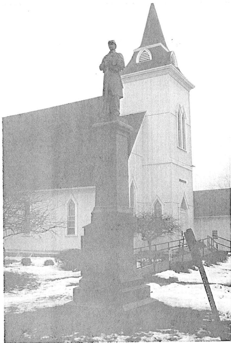
Civil War Monument Garden Plain, IL