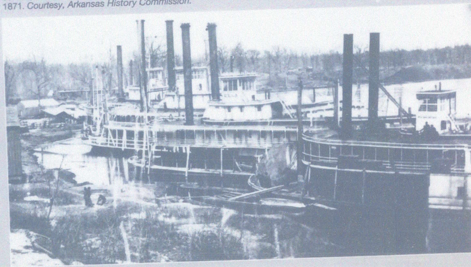
Steamboats carried cargo to DeValls Bluff, where it was shifted to the railroad. Here, the Pocahontas, Ella and Emma No. 2 are docked at DeValls Bluff.