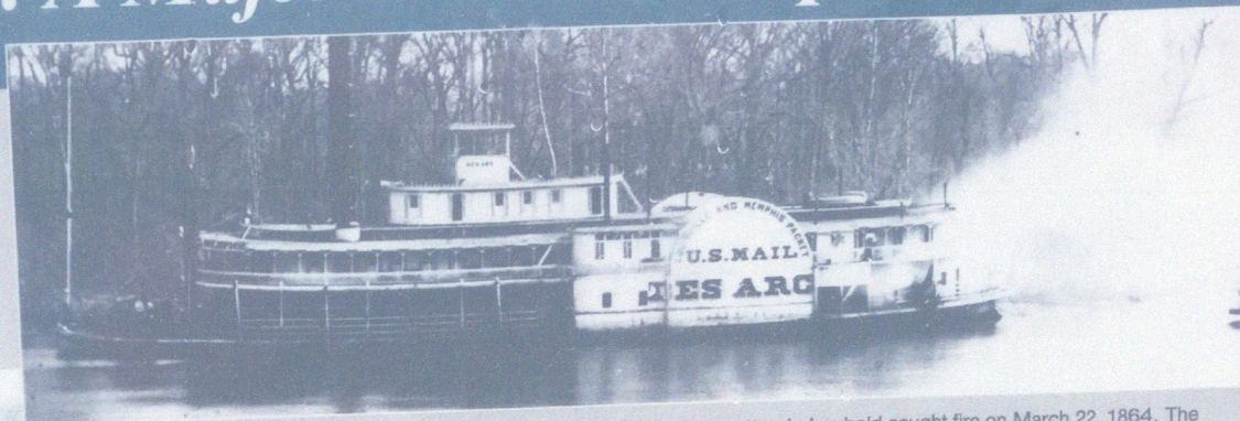
The steamboat Des Arc was moored at DeValls Bluff when cotton in her hold caught fire on March 22, 1864. The U.S.S. Signal towed her across the river to protect other vessels docked nearby and, when the flames grew out of control, sank her with cannon fire. The Des Arc was later raised and continued serving as a White River packet until 1871.

With its tall bluffs towering over the White River, DeValls Bluff was easily defensible and became the most important port on the river during the Civil War. Union gunboats could easily travel to the town, providing security for the steamboats carrying supplies that would then be transferred for railroad transport to Little Rock.