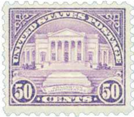
U.S. #701 1931 50¢ Arlington Amphitheater Rotary Press Issue Date: September 4, 1931 First City: Washington, DC

The Arlington Memorial Amphitheater is located on a hill overlooking Washington, D.C. This roofless, white marble structure encloses a natural amphitheater (a level area surrounded by sloping ground). A temple facing the Lincoln Memorial (located across the Potomac River) forms the front of the structure. The Tomb of the Unknown Soldier is located just before its entrance. The Arlington Amphitheater was dedicated in May 1920.