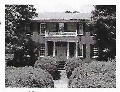
View waymark gallery

Clickhere to view the complete way mark directory