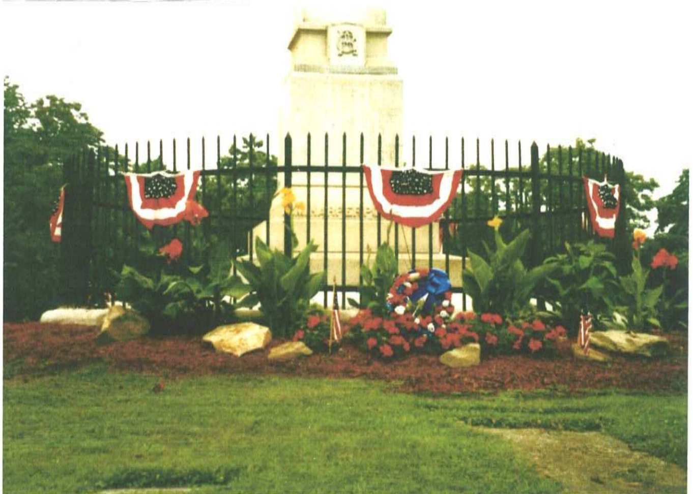
AFTER IN 1978