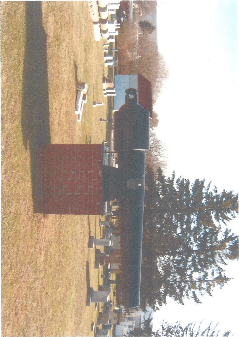
North Side looking South