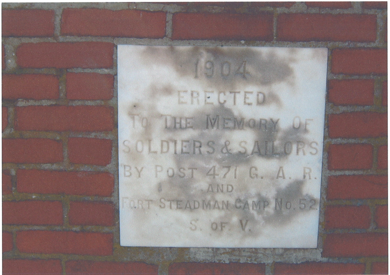
East Side of Base