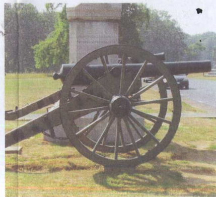
Once restored, this is how the Civil War Parrott cannon will look. Photo shows the same Parrott cannon at Gettysburg National Military Park.

In recognition of the 150th anniversary of the American Civil War (1861-1865), and to honor the memory of those Oneida County citizens who sacrificed, fought, and died for the Union cause, the society has initiated a project that will result in the placement of one of these units on permanent exhibit in front of its building at 1608 Genesee Street in Utica. Unlike its previous years on display, the restored cannon will be protected under the cover of an architecturally appropriate pavilion that provides an unimpeded view but also protects the piece from the elements.