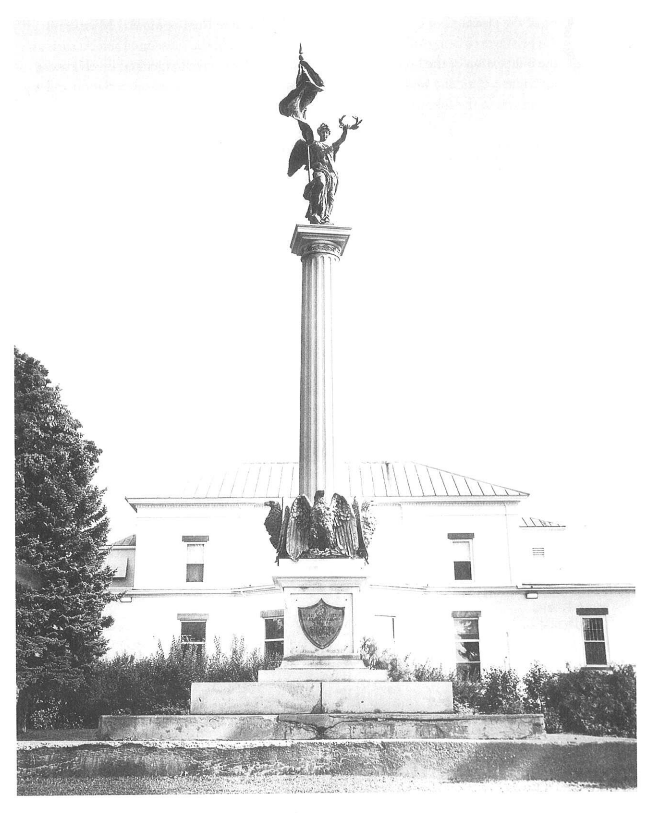
The Spirit of Liberty, 1905, bronze, Library Park, Ogdensburg, NY.