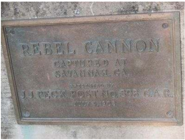
4. Rebel Cannon Plaque Rebel Cannon captured at Savannah, GA. Presented by J.J. Peck Post No. 398 G.A.R., July 4, 1903