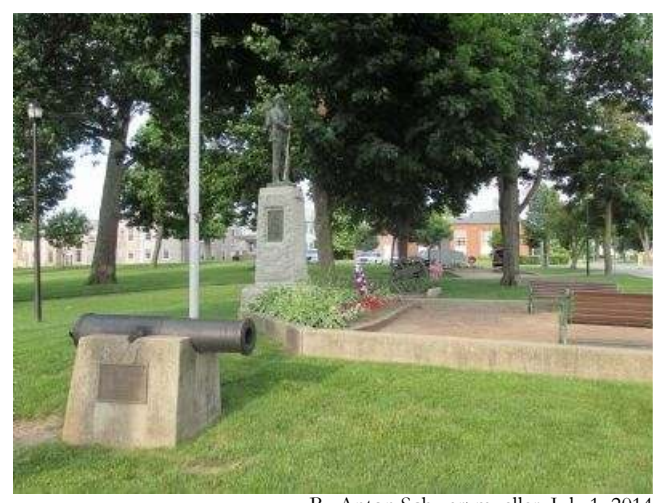
By Anton Schwarzmueller, July 1, 2014 2. Eastward View In Honor of Those Who Fought Marker Note the captured rebel canon. The memorial faces Main Street.