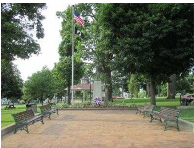
3. In Honor of Those Who Fought Marker Wide View from Main Street.