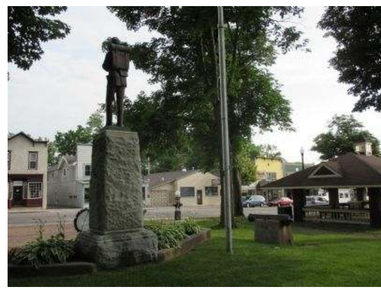
July 1, 2014

6. Rear View In Honor of Those Who Fought Marker