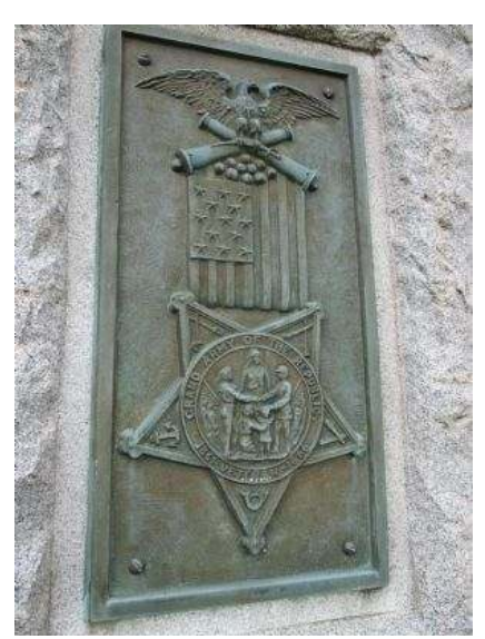
By Anton Schwarzmueller, July 1, 2014 5. G.A.R. Plaque on West Side of Memorial