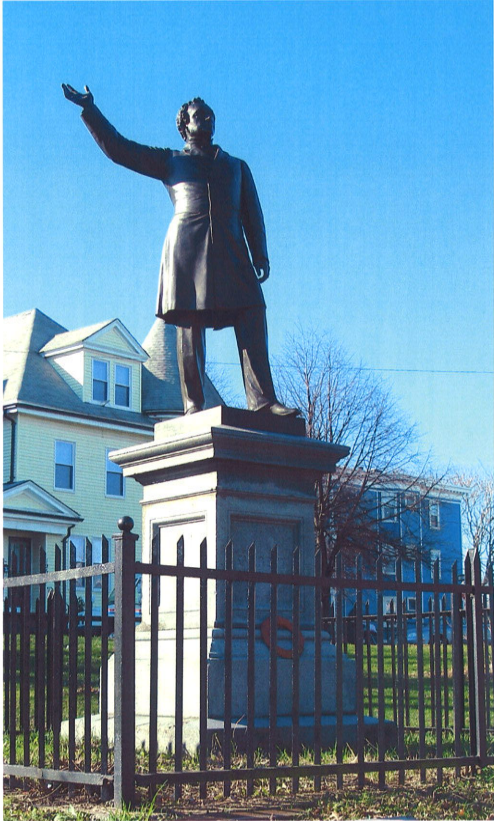
FRONT RIGHT OF MONUMENT