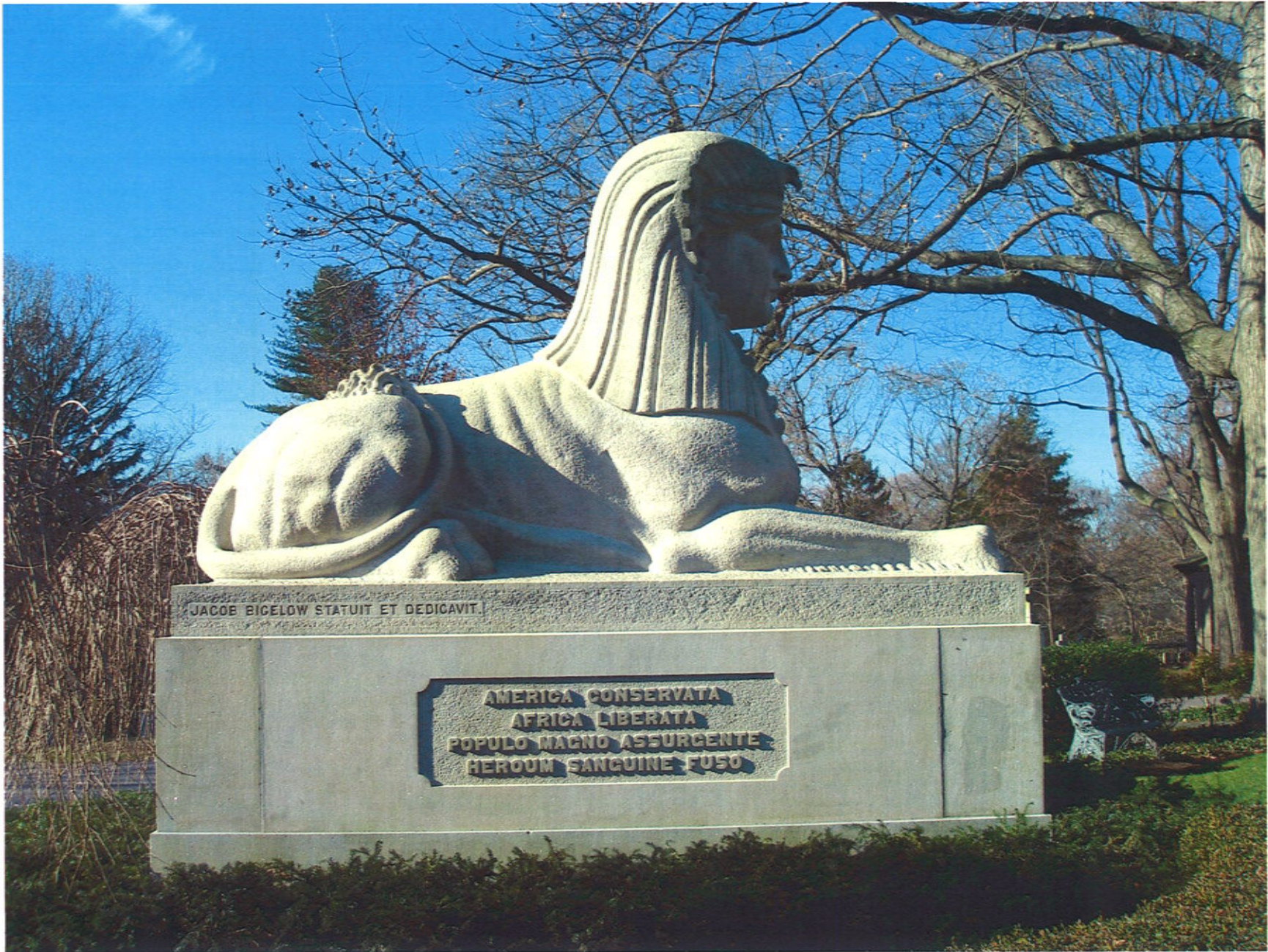
RIGHT SIDE MONUMENT