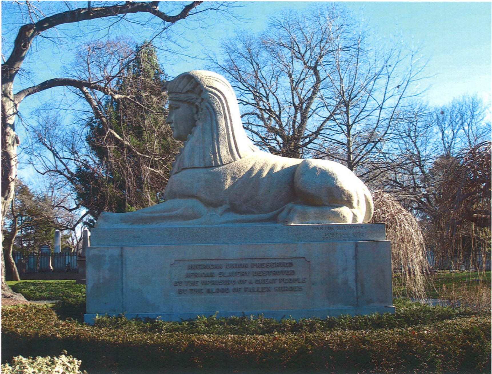
LEFT SIDE MONUMENT