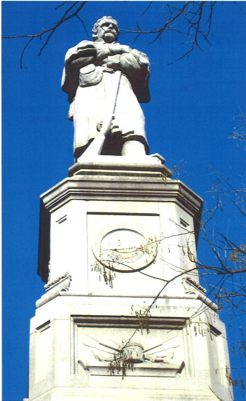
FRONT TOP MONUMENT