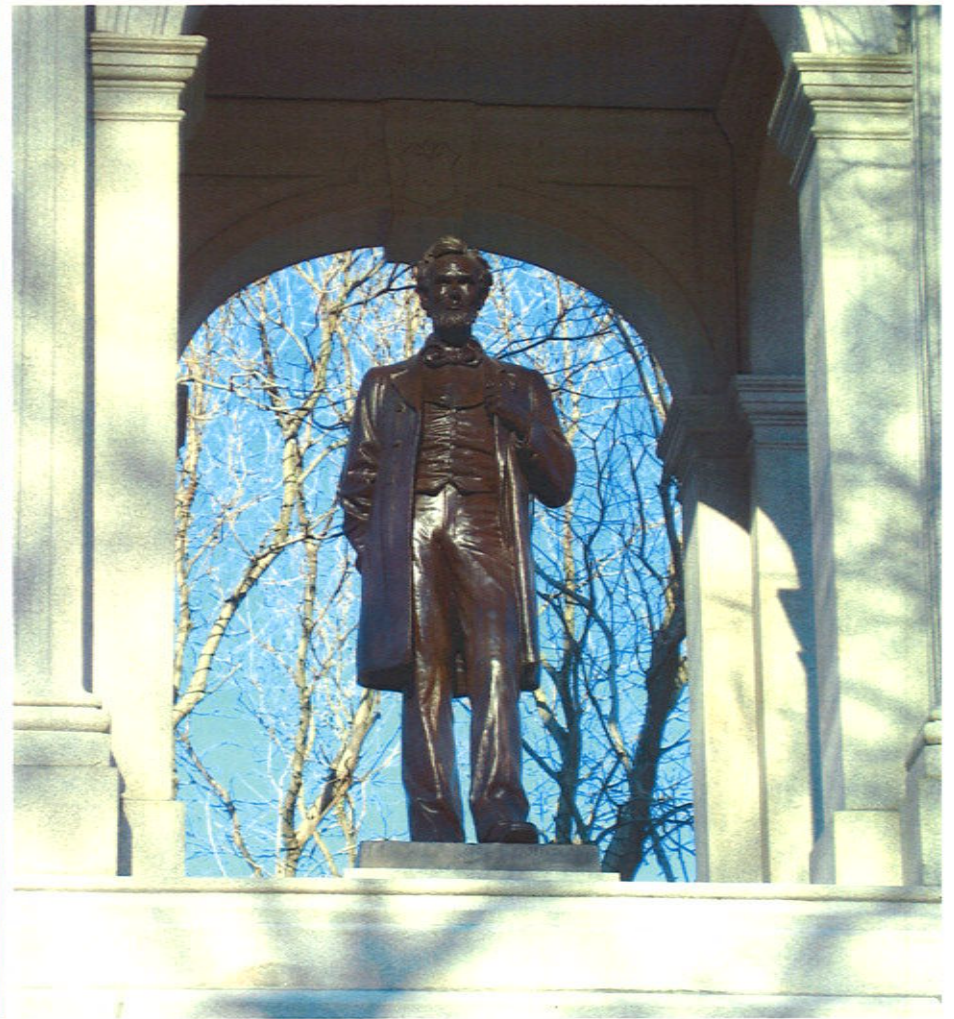
FRONT LINCOLN STATUE