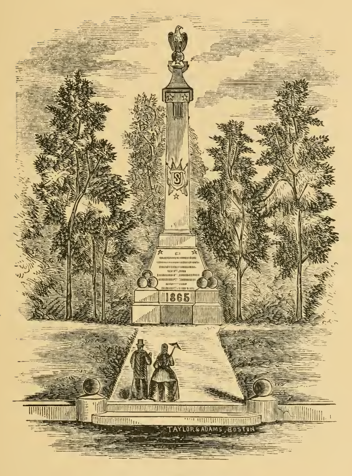
SOLDIERS' MONUMENT, EVERGREEN CEMETERY, BRIGHTON, MASS.