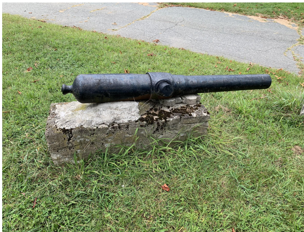
Cannon one. Notice the front of the cannon resting on a broken patio brick