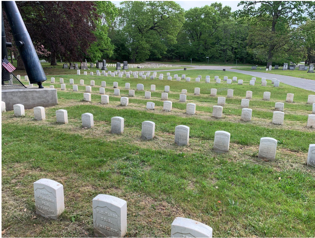
Photo showing straightening and cleaning work done by Mass SUVCW brothers