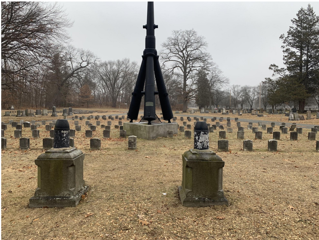
Photo showing the concrete shell casings at the entrance to the plot.