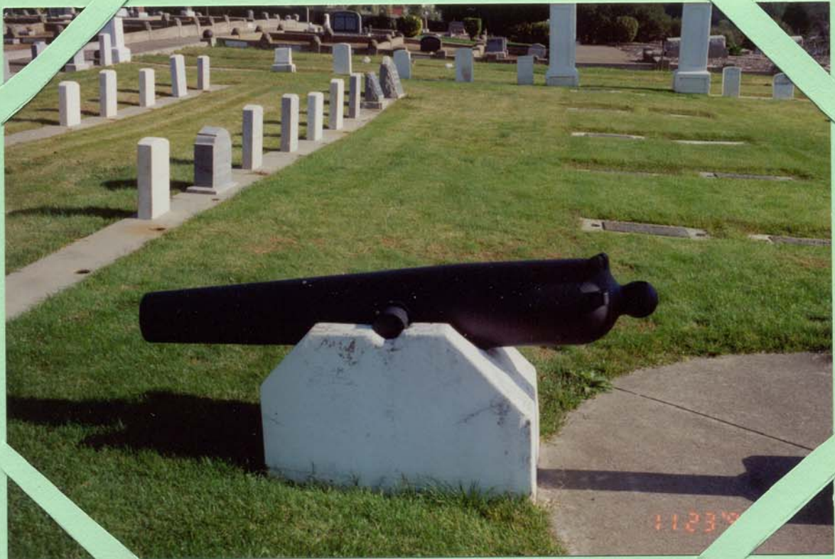
LONE TREE CEMETERY 24591 FAIRVIEW AVE, HAYWARD, CA VETERANS PLOT-NORTHERLY OF FLAG POLE 4 1/4" RIFLED BRASS CANNON LOOKING EASTERLY