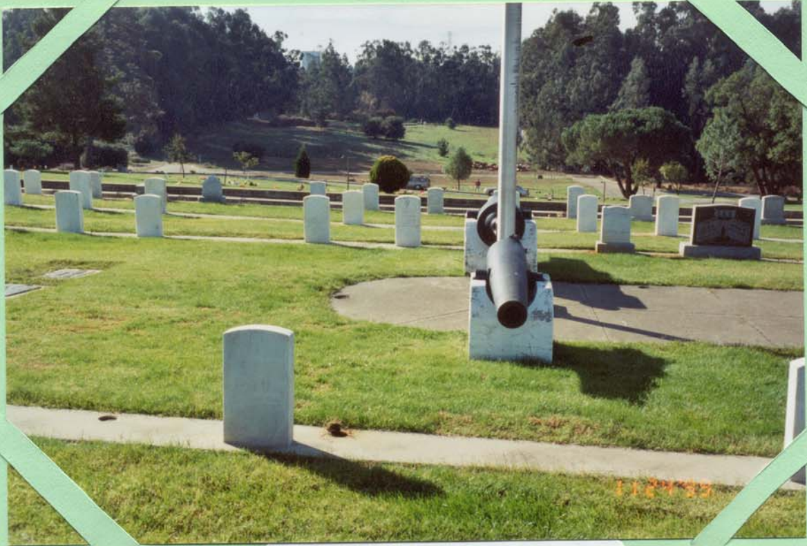
LONE TREE CEMETERY 24591 FAIRVIEW AVE, HAYWARD, CA VETERANS PLOT-NORTHERLY OF FLAG POLE