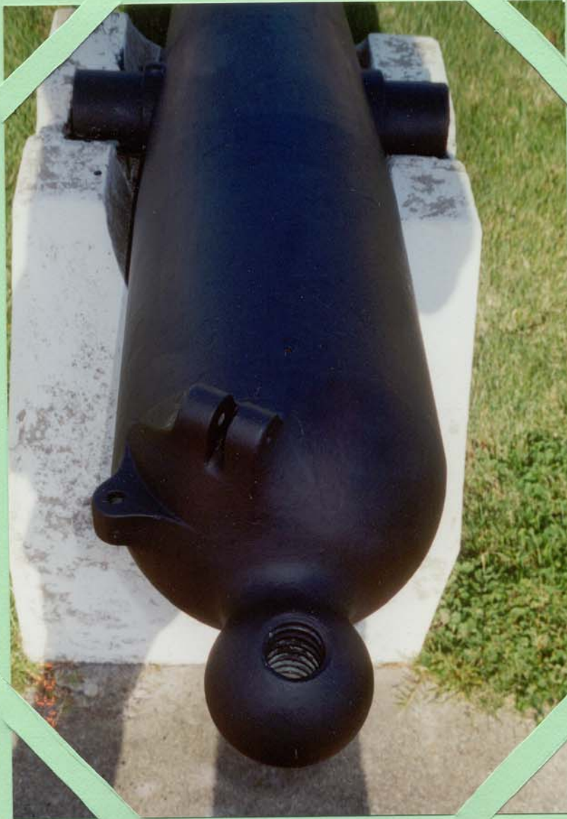
LONE TREE CEMETERY 24591 FAIRVIEW AVE, HAYWARD, CA VETERANS PLOT-NORTHERLY OF FLAG POLE SMALL CANNON WITH ELEVATION SCREW THREADING IN CASCABEL