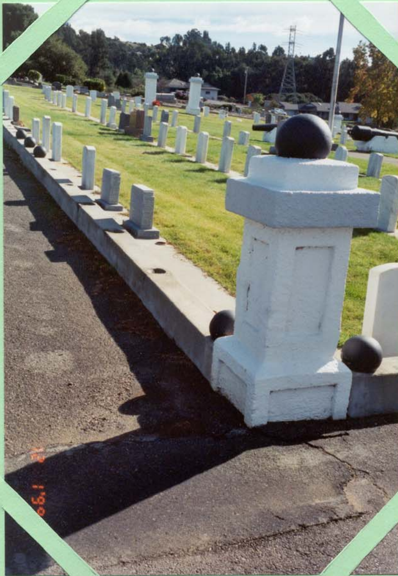
LONE TREE CEMETERY 24591 FAIRVIEW AVE, HAYWARD, CA VETERANS PLOT-NORTHERLY OF FLAG POLE SOLID SHOT DISPLAY LOOKING SOUTHEAST