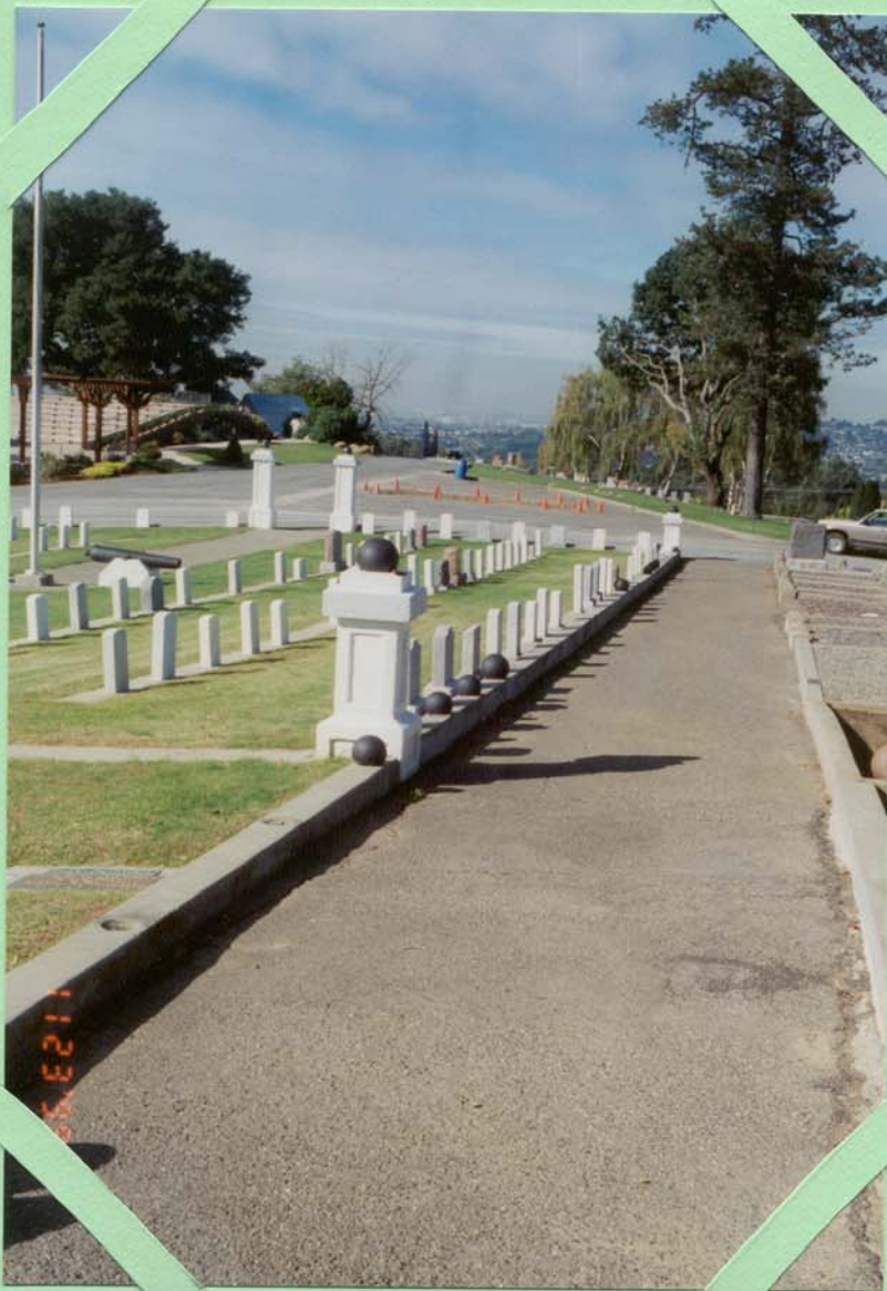
LONE TREE CEMETERY 24591 FAIRVIEW AVE, HAYWARD, CA VETERANS PLOT-NORTHERLY OF FLAG POLE LOOKING SOUTH WESTERLY SOLID CANNON BALLS USED FOR DISPLAY TOO LARGE FOR DISPLAYED CANNON