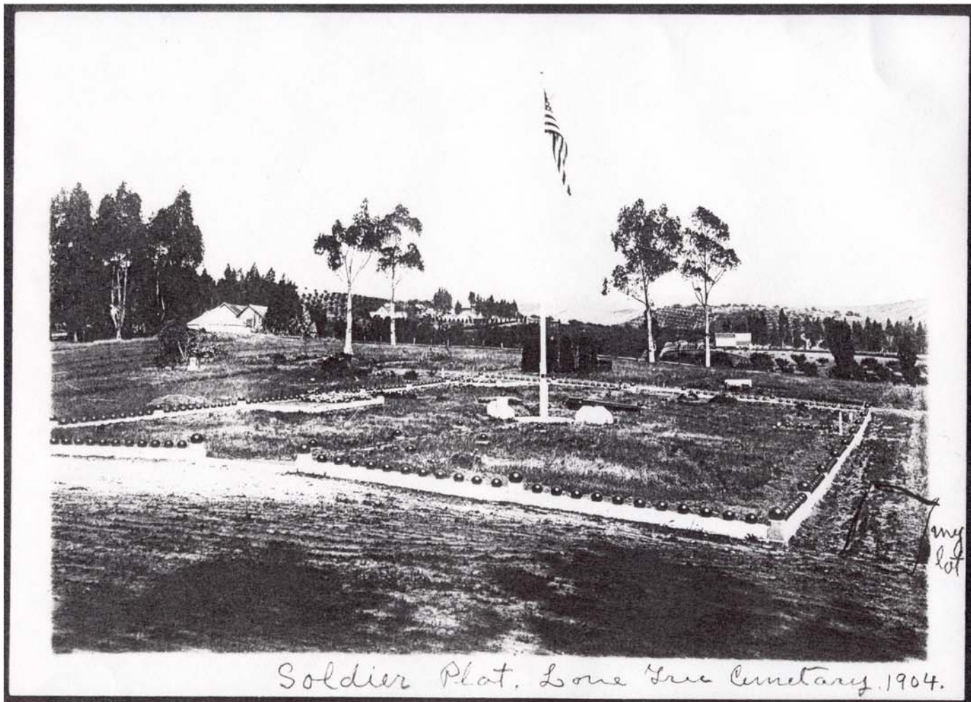
Soldier Plot, Lone Tree Cemetery, 1904.