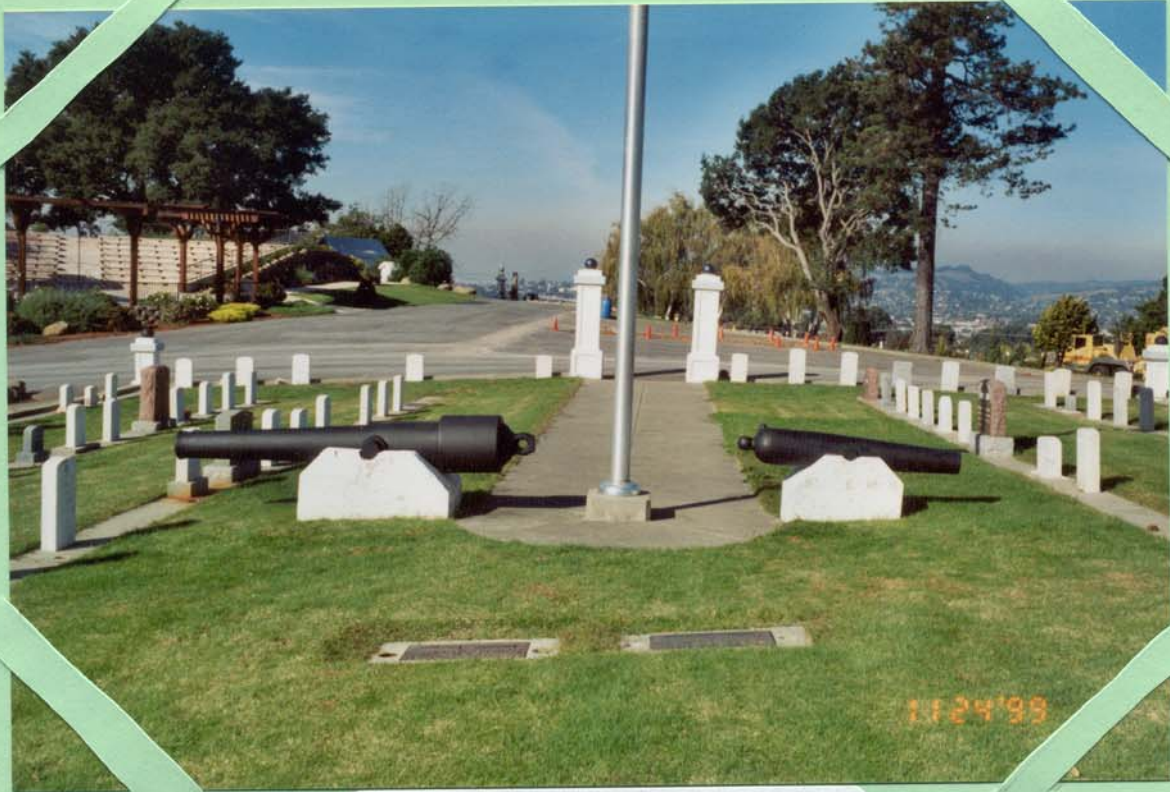
LONE TREE CEMETERY 24591 FAIRVIEW AVE, HAYWARD, CA VETERANS PLOT-NORTHERLY OF FLAG POLE OVERVIEW LOOKING WESTERLY SMALL BRASS CANNON TO RIGHT-RIFLED