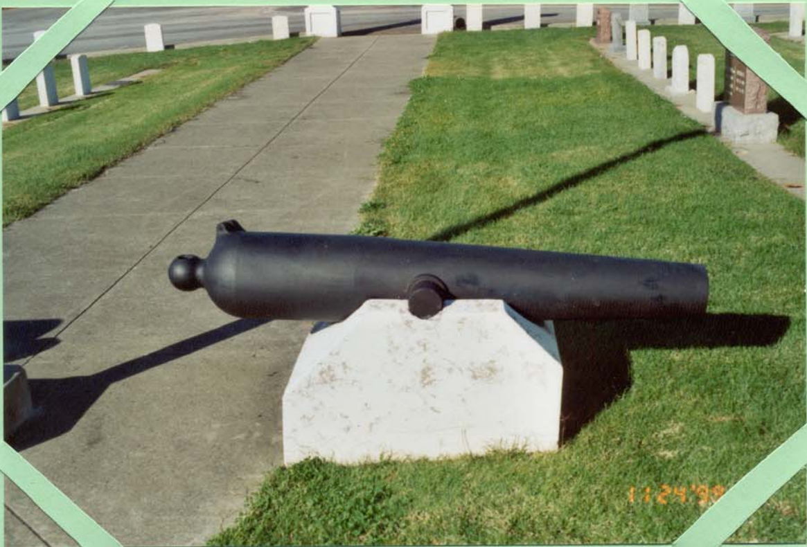
LONE TREE CEMETERY 24591 FAIRVIEW AVE, HAYWARD, CA VETERANS PLOT-NORTHERLY OF FLAG POLE SMALL CANNON - LOOKING WESTERLY