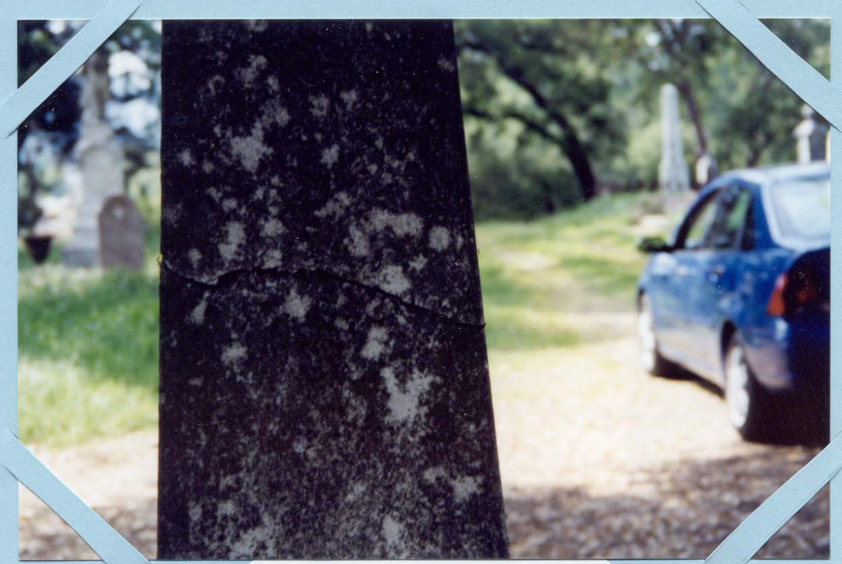
MATHESON MEMORIAL OAKMOUND CEMETERY HEALDSBURG, SONMA COUNTY, CA PHOTO TAKEN 1 APR 2004 BY JAMES SPENCER, SUVCW 101 SUNRISE MOUNTAIN ROAD CAZADERO CA 95421