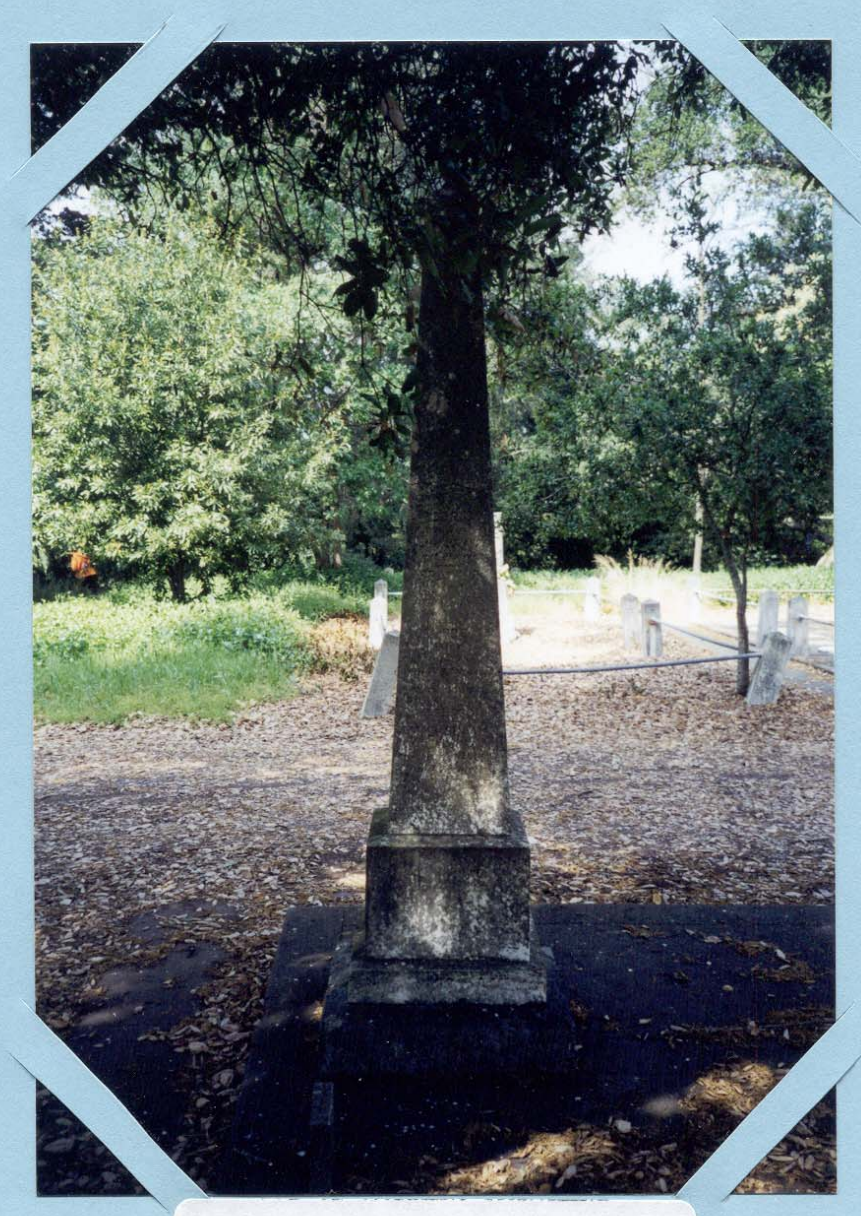
Matheson Memorial Oakmound Cemetery Healdsburg, Sonoma County, CA Photo Taken 1 Apr 2004 by James Spencer, SUVCW 101 Sunrise Mountain Road Cazadero, CA 95421 East Face - Looking Westerly