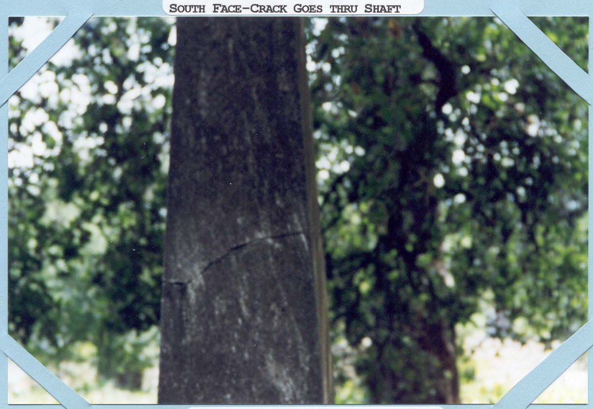
MATHESON MEMORIAL OAKMOUND CEMETERY HEALDSBURG, SONMA COUNTY, CA PHOTO TAKEN 1 APR 2004 BY JAMES SPENCER, SUVCW 101 SUNRISE MOUNTAIN ROAD CAZADERO CA 95421