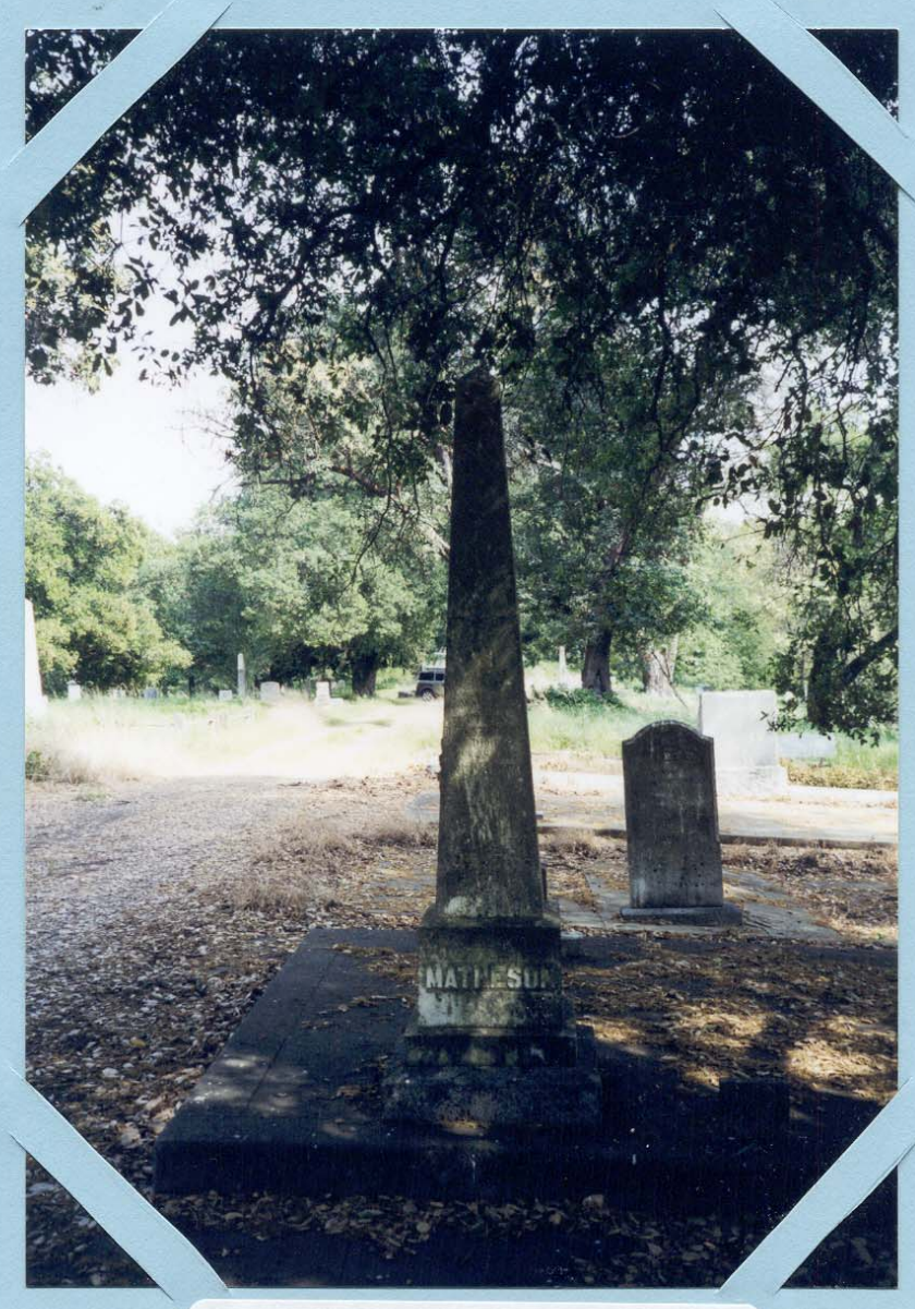
MATHESON MEMORIAL OAKMOUND CEMETERY HEALDSBURG, SONMA COUNTY, CA PHOTO TAKEN 1 APR 2004 BY JAMES SPENCER, SUVCW 101 SUNRISE MOUNTAIN ROAD CAZADERO CA 95421 NORTH FACE LOOKING SOUTHERLY